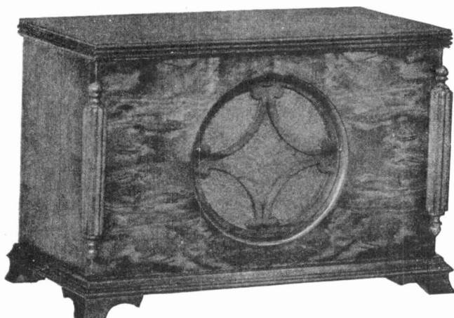
KERSTEN TABLE SPEAKER No. 4

Don't forget to see our complete line of Radio Speakers at the R. M. A. TRADE SHOW, June 3 to 7, Inc., at the Stevens Hotel—Demonstrating Room 545; Display Booth 33-D.