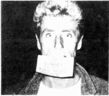
WHO'S FOR LUNCH — When WB's Who played San Francisco, KRQR spotted singer Roger Daltrey backstage, enjoying a light snack. The singer obviously wanted to show his appreciation for the station's support of the band.