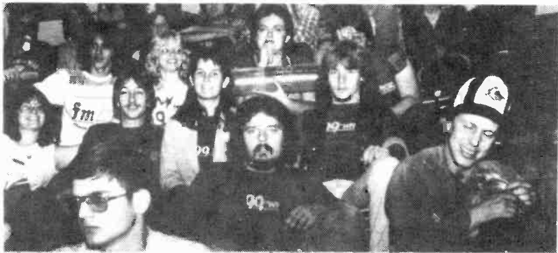
YOUR T-SHIRT PLEASE — T-shirts served as tickets when WNOR/Norfolk offered four regional bands plus RCA's Steel Breeze in a special concert admissible only to those wearing the station's T-shirts. 10,000 shirts were sold at $1.98 each for the overflow show.