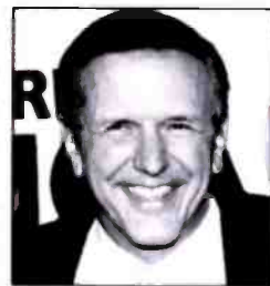
Face for radio and TV.