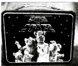
XM: Preferred by Pigs in Spaaaaaaace!