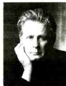
Sorry, that was too easy...