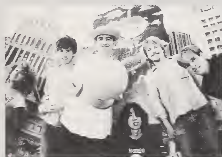
POI DOG PONDERING

THE BLUEST OF THE BLUE —The annual W.C. Handy Awards for the best blues performers was a coup for Alligator Records, the roots-conscious Chicago indy. Koko Taylor was named Female Blues Entertainer of the Year for the tenth time. And Alligator's Albert Collins was named Instrumentalist of the Year. It was Collins' eighth Handy award. Collins also has a Grammy Award on his mantel to go with the priceless memories of filming a wine-cooler commercial with Bruce Willis .