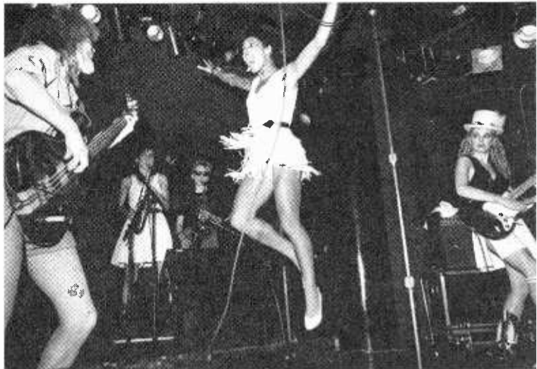
BELLE STARS —The Belle Stars, who record for Stiff in the U.K., make their U.S. debut at Danceteria in New York.