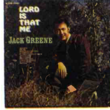
COUNTRY JACK GREENE— Lord Is That Me. Decca DL 75188 (S)

This great country duo does "Tomorrow Is Forever," their current smash single, in addition to "Forty Miles from Poplar Bluff," "Silver Sandals" and others. It is a powerful package, full of true country flavor.