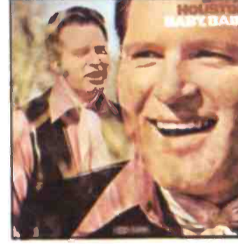
COUNTRY DAVID HOUSTON— Baby, Baby. Epic BN 26539 (S)

Robin Gibb, formerly of the Bee Gees, makes his solo debut with this album, and it should take off like wildfire. The creative quality that was the Bee Gees' trademark is very evident in this collection of Gibb's originals, and all are outstanding. A good singles bet is the opener "August October," but "Give Me a Smile" and "Saved by the Bell" should not be overlooked.