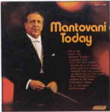
POP MANTOVANI TODAY— London PS 572 (S)

Here's solid gold in the bank! Not only are the top hits featured such as "I Heard It Through the Grapevine," "Nitty Gritty," "Friendship Train," and "I Wish It Would Rain," but the wild new single, "You Need Love Like I Do" is spotlighted as well. They're all winners, and the package spells top of the chart action.