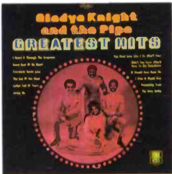
POP GLADYS KNIGHT & THE PIPS— Greatest Hits. Soul SS 723 (S)

"Lonely Bull," "Taste of Honey," "Whipped Cream" and "Zorba the Greek" are only four of the dozen hits here that will supply Alpert fans with excitement. Greatest they are, not just as showmen, but in musicianship as well. Top chart item here.