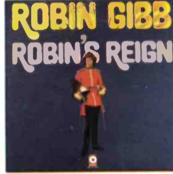
POP ROBIN GIBB— Robin's Reign. Atco SD 33-323 (S)

This highly unusual album teams Spooky Tooth, a British underground group with a good album track record, with Pierre Henry, one of the foremost electronic composers of today. The result is a set that will draw considerable underground and college attention. This is music of today carried a step farther. The electronic effects of selections such as "Jubilation" stand out as do the group's strong vocals and instrumentalations.