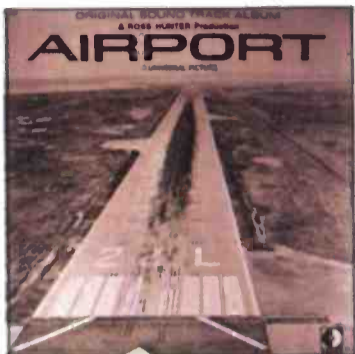
SOUNDTRACK AIRPORT— Airport. Decca DL 79173 (S)

Alfred Newman has written a soaring score for "Airport." It's geared to a big picture but it is so well-fashioned that standing alone, it makes a big soundtrack package. Decca has its big promotional guns behind it, so its takeoff chances are solid.