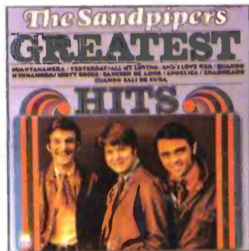
POP SANDPIPERS— Greatest Hits. A&M SP 4246 (S)

Eddy Arnold has surrounded himself here with some super-guitar backing that helps enrich an already splendid ballad repertoire. Arnold's style is as warm and winning as ever, and such familiars as "with Pen in Hand," "Leaving On a Jet Plane," and "Mary in the Morning" benefit by his handling. Current single "Soul Deep" is featured.