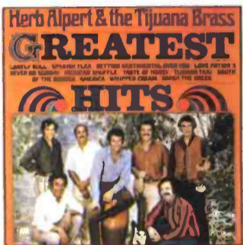
POP HERB ALPERT & THE TIJUANA BRASS— Greatest Hits. A&M SP 4245 (S)

Truly a "greatest hits" collection, this LP covers an enviable time period of Beach Boys prosperity, from "I Get Around" and "Barbara Ann" to "I Can Hear Music" and the classic "Good Vibrations," from the simple harmonies of the surfing sound to the intricate complexities now the rage in pop music. Sure to be a collector's item.