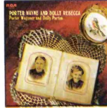
COUNTRY PORTER WAGONER & DOLLY PARTON— Porter Wagoner and Dolly Rebecca. RCA Victor LSP 4305 (S)

Devotees of the country duo will find this a fascinating album. Top talent sings top tunes. The material includes a sprinkling of Bill Anderson songs, including "If It's All the Same to You" and "The Untouchables," plus such standards as "Since I Met You Baby."