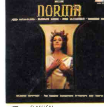
CLASSICAL BELLINI: NORMA— Sutherland/Horne/Variuos Artists/London Symphony (Bonyng). London OSA 1394 (S)

It's "Segovia Month" at Decca for guitar master Andres Segovia, and the 18-year label veteran features a new eight-movement suite, "Castles of Spain," penned for the maestro by the prominent Spanish composer, F. Moreno Torroba. Recorded this past December in Madrid, Segovia's latest also features works by Dowland, Schale, Weiss and Grieg, and should follow his other works into the mainstream of classic guitar repertoire.