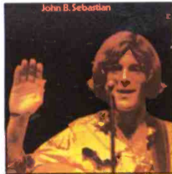
POP JOHN B. SEBASTIAN— Reprise RS 6379 (S)

The Sandpipers, consistent chart riders since the release of their debut hit, "Guantanamera," is assured of success with this release of all their great hits on a single LP. Given the magic Sandpipers touch are beautiful and immortal tunes like "Misty Roses," "And I Love Her," "Yesterday" and of course, "Guantanamera."