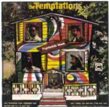
POP THE TEMPTATIONS— Psychedelic Shack. Gordy GS 947 (S)

Alfred Newman has written a soaring score for "Airport." It's geared to a big picture but it is so well-fashioned that standing alone, it makes a big soundtrack package. Decca has its big promotional guns behind it, so its takeoff chances are solid.