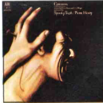
POP SPOOKY TOOTH/PIERRE HENRY— Ceremony. A&M SP 4225 (S)

His initial entry for the label finds the former Lovin' Spoonful member in a heavy commercial bag that will put him right up the chart with solid sales impact. Most of the material, including updating of "She's a Lady," and "You're a Big Boy Now," is powerful. Standouts are the driving, "What She Thinks About You," the swinger "Baby Don't Ya Go Crazy," and "Room Nobody Lives In." Exceptional LP cover.