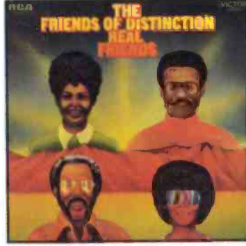
POP FRIENDS OF DISTINCTION— Real Friends. RCA Victor LSP 4313 (S)

The fantastic Stevie Wonder has been captured in all the excitement of a live performance, and it includes some of his greatest performances. From "Shoo-Be-Do-Be-Doo-Da-Day" to his recent "Yester-Me, Yester-You, Yesterday" it's a powerhouse of action, and is sure to ride straight to the top of the sales charts.