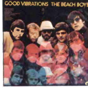
POP BEACH BOYS— Good Vibrations. Capitol ST 442 (S)

The four Friends of Distinction have jumped into the thick of the Pop-soul races and are rapidly moving to the head of their class, now ruled by the slick Fifth Dimension. But a quick succession of gold disks have made their new single, "Love or Let Me Be Lonely," an instant hit, and matched with "Crazy Mary" and "Just a Little Lovin'," the album could push this soulful, high-energy group to the top.