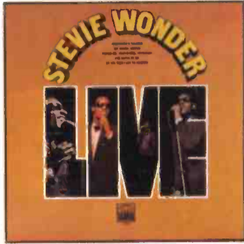
POP STEVIE WONDER LIVE— Tamla TS 298 (S)

With their smash "Psychedelic Shack" as the headliner, this album can't miss for the Temptations. They're at their very best with a solid rock program that also includes their unique interpretations of "Friendship Train," "You Need Love Like I Do (Don't You?)" and "Take a Stroll Thru Your Mind," which lasts more than 8 minutes.