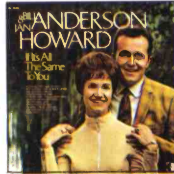
COUNTRY BILL ANDERSON & JAN HOWARD— If It's All the Same to You. Decca DL 75184 (S)