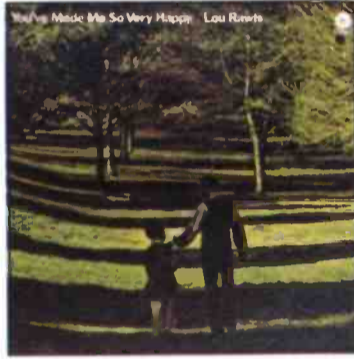
POP LOU RAWLS—You Made Me So Very Happy. Capitol ST 427 (S)

Mantovani can do anything. This may be superfluous but here once again he proves it, this time turning his baton and taste to today. His artistic touch is everywhere, flying like in "Up, Up, and Away" or breezy as in "Blowin' in the Wind."