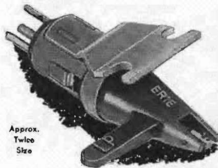
Approx. Twice Size

From the pioneer in ceramics for electronics