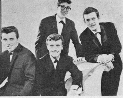
THE SHADOWS Wonderful land/Stars fell on Stockton COLUMBIA 45-DB4790

The other item is a real rouser with bongos and rouser with bongos and conga drum driving the lyric along. There are lots of shouts back and forth in dialect by the boys. It's great fun.