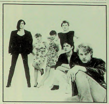
Human League - in an MOR direction