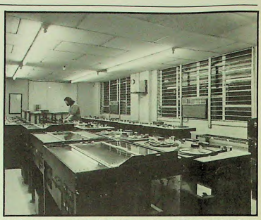
for. Among these have been singles Spick and span - the tape duplicating department at the Immediate Sound Services factory.

By the very nature of mass-ISS is happy to oblige. Machinery also production, manufacturing errors can but the company prides itself on the All this technical support means the strictness of its quality control inspecfactory is capable of turning out annual- tion - visual scanning of all records and random continuous audio checks as well - to ensure that mistakes are spotted and corrected before the finished copies