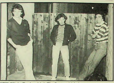
NEW ON the Teesbeat label. The Commercial Artists

able for several months. However, all the record will be available from the end problems have now been resolved and of lanuary