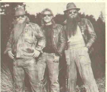
ZZ Top's French gigs were sponsored by NRJ.

NRJ were involved in the big- number among the shareholders gest concert of Madonna's Eu-