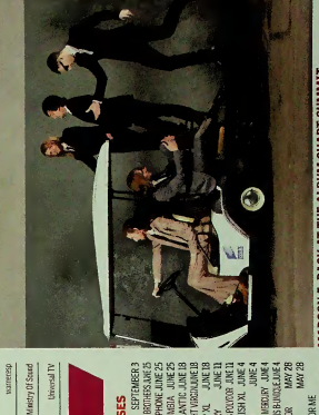
MAROON 5: BACK AT THE ALBUM CHART SUMMIT