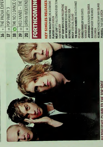
RAZORLIGHT: CLIMB TO THE TOP SPOT