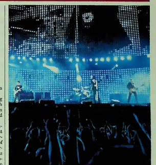
U2: switch from Island to Mercury to continue working alongside A&R team