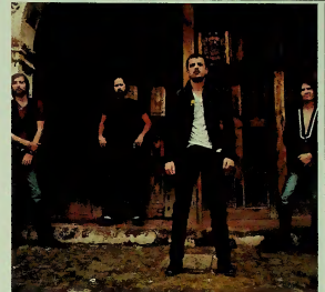
The Killers: new album nears platinum sales in first week, selling nearly 270,000 copies

With Evanescence's The Open Door debuting at number two on