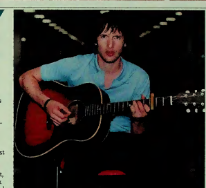
James Blunt: biggest-selling album of 2005

the previous week. In Christmas week, artist album sector sales tallied 8,572,001, with the top five albums all clearing the 200,000 sales mark, while the top 16 sold more than 100,000 and 98 exceeded 10,000 sales. Last week, with artist album sales at 3,309,626 - down 61,39% -Curtain Call topped the list with