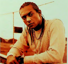
will be driven by the massive single We Be Burnin

San Diego-based Louis XIV are set to release their major-label debut on October 17. The UK story really began to gather pace