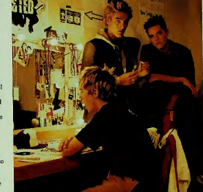
Busted: among of string of acts posting album rises following the Brit

Thursday March 4th, 2004 Grosvenor House Hotel, London