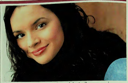
Blue Note aims to recapture debut album magic

the company has nothing else to add to the BBC's statement. "We will be meeting with the BBC in due course to try and see if we can