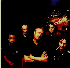
Elbow are back: Cast Of Thousands wins critics' approval and surpasses its predecessor at number 7

counter than a week ago. Increased use of TV advertising and festival fever helped to shore up the sector.