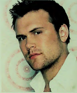
Bedingfield's Gotta Get Thru This shows staying power in race for year-to-date chart

when it was repackaged in March. With the school holidays now well and truly under way, the singles market recovered a little from its 27-week low - but only a