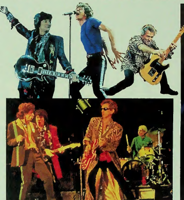
The Rolling Stones: cancelling their British tour due to UK tax restrictions

With the Phoenix Festival cancelled due to poor ticket sales, it would seem that the live arena is looking at tough times ahead but, reports Nick Tesco, the main players see it as simply a temporary upset