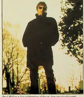
Paul Weller: a line celebration of the ex-Jam man's solo work

IRON MAIDEN: Raising Hell (PMI MVN 49012643). Iron Maidan's last performance with singer Bruce Dickinson is captured at Pinewood Studio in conjunction with horror illusionist Simon Drake, Two hours long, Raising Hell is out on September 5 at a dealer price of £8.84. It is probably the most entertaining value for-money metal video around and should get snapped up.