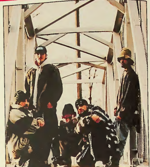
Kaliphz: Rochdale rap crew set for success

R&B (Charly CDRB 9). A superb compilation, top heavy with Sixties' talent from the more soulful side of R&B. Certifiable classics