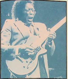
LIVE TIME: BUDDY GUY AT THE MONTREUX, JAZZ FESTIVAL