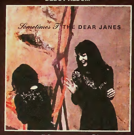
Sometimes 9 A COLLECTION OF SONGS ABOUT EVERYDAY DISASTERS, CONVOLUTED LOVE LIVES, NUNS, AND UNSPEAKABLE PRACTISES AVAILABLE 18TH APRIL 1994