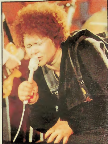
SHE'S GOT RHYTHM: ETTA JAMES IS BACK WITH A NEW COLLECTION OF 20 TRACKS

Roomful Of Blues. Duke Robillard is now better known an a cuasacoful colo more of a rock feel to it - something that PointBlank feels will help cro him over to a more mainstream audience.