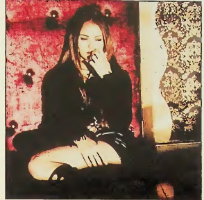
Vanessa Paradis: Tous Les Clips video of world tour