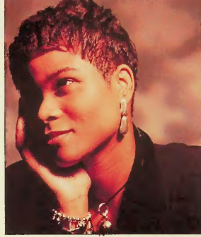
Gabrielle: much sought after white label gets official release

Guaranteed banker Should do well Worth a punt Only for the brave SOR only