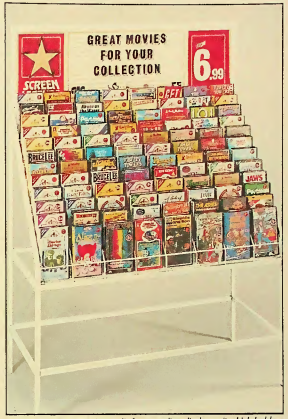
PICKWICK'S SCREEN Legend's free-standing display unit which holds up to 96 titles.