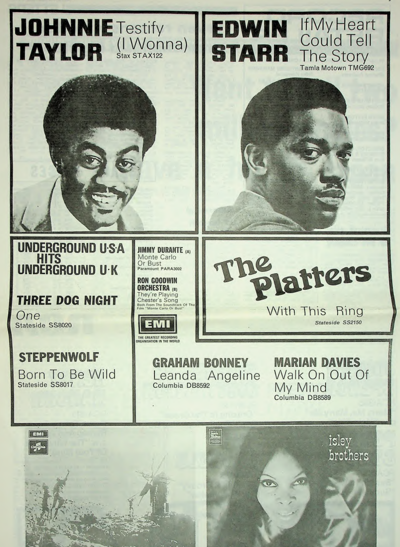
Behind a Painted Smile

Soundtrack from the film "MORE" co Columbia SCX6346