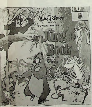
Jungle V.I.P.'s Disney Presents Songs From Jungle Book" And Other Jungle Favourites 1133 (<sup>M)</sup> MALS 1133 (S)