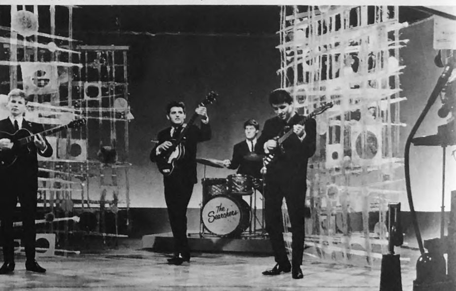
Rehearsing for ABC-TV's "Thank Your Lucky Stars".