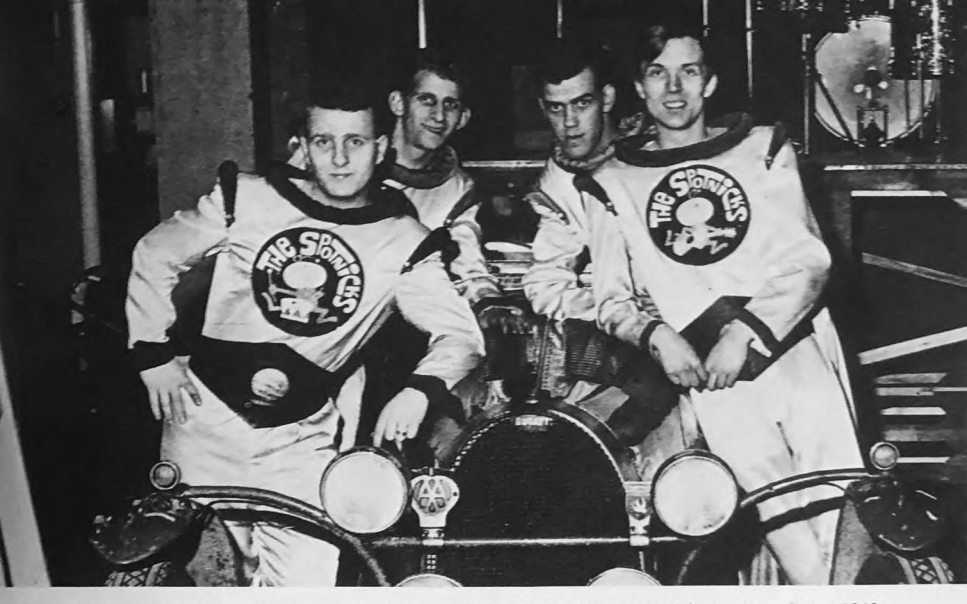
The Spotnicks from Sweden are another group who had a very successful tour here during 1963