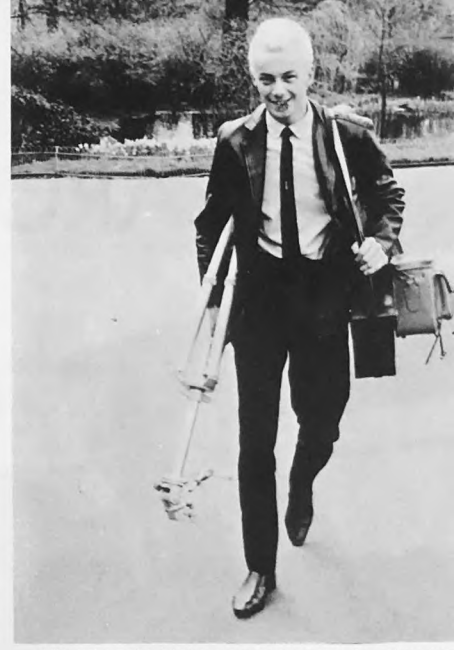
"Chewing a leaf helps me concentrate when I'm out with a camera—one of my pet hobbies."