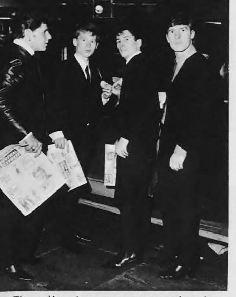
The week's serious moment—when we learn from the musical papers—where we stand in the charts.