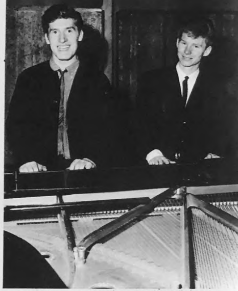
Searching for a tune for a four-handed duet.