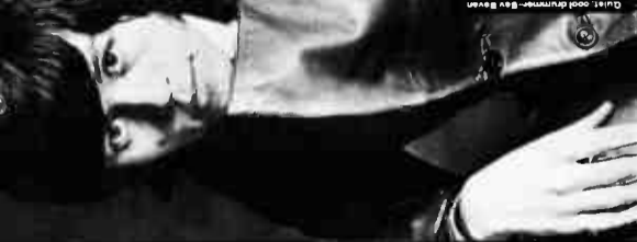
Quiet, good drummer—Ray Bevan