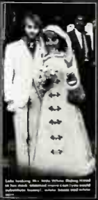
Like looking in a top. White, shiny and as has that, it's more cool. I've used whatever I can, white, black and white and...