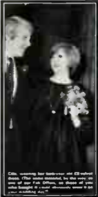
Like, wearing her best-year old (I prefer dress). (The same, married, by the way, as one of our Fab Girls, as dress of you who thought it would obviously come to her wedding day.