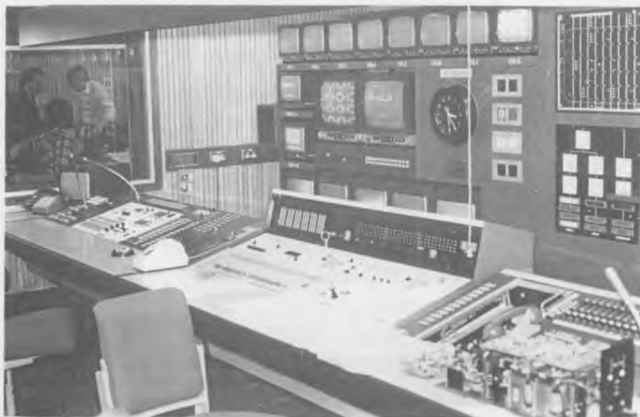
Studio B production and vision control room undergoing acceptance tests