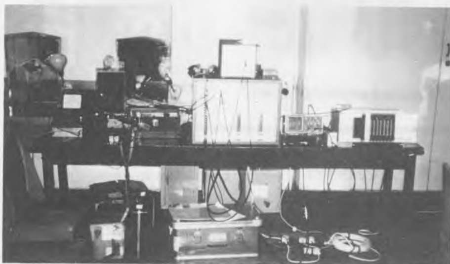
Digital Equipment at Shanghai City Hall

provide the required number of channels. Other equipment will also be provided which can add or insert channels to a six channel bitstream without decoding the PCM, or conversely extract two channels from a bitstream to send to some special destination.