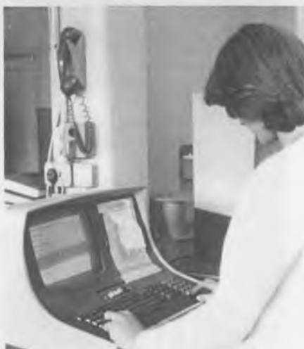
Checking whether or not an item is in stock