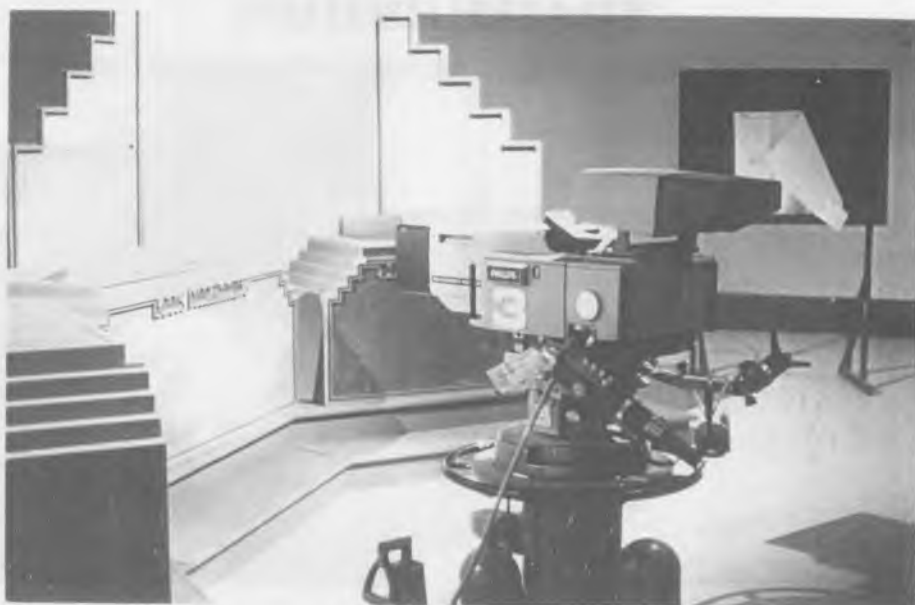
A Philips LDK 25 camera ready for "Look Northwest"

A combined production and vision control room houses a Central Dynamics 480 vision mixing desk, incorporating a Quantel DPS 3000 special effects unit. Cox 2 and 3 level synthesizers can be used in conjunction with a three part monochrome caption scanner and Ryley Caption Generator. Also in this area is a Thornlite 120 lighting console, which can handle up to one hundred and twenty channels connected to it; the console can store information about a hundred different lighting plots. The studio has four Philips LDK25 cameras. The sound control room houses a 28 channel Calrec mixing desk, Studer B62 tape recorders, and EMT950 record desks.