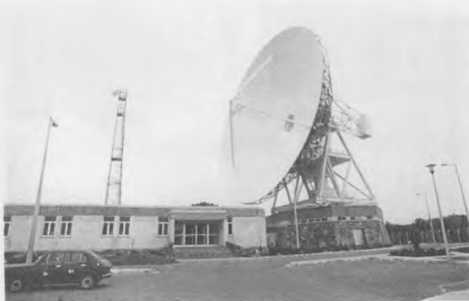
The Makarios ground station