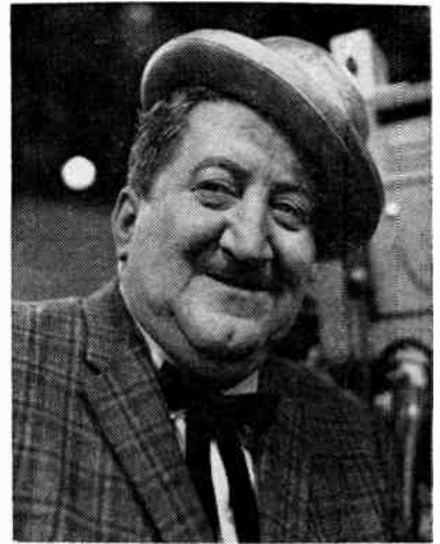
Fans of Charlie Chamberlain can see him twice this week — Monday, as usual, on Don Messer's Jubilee, and Thursday at 9:30 p.m. on Telescope.

King; Austin Willis as Admiral Fox; Harold J. Stone as Enzo Morrell; Gordon Pinsent as Grainger; and Anne Collings as Elaine Miller.