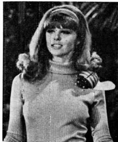
Curvaceous Tina Louise plays Clem Kadiddlehopper's girlfriend on the Red Skelton Show, Tuesday at 8:00 p.m.

Rob and Laura are dismayed by Millie Helper's jealousy of their new neighbors.