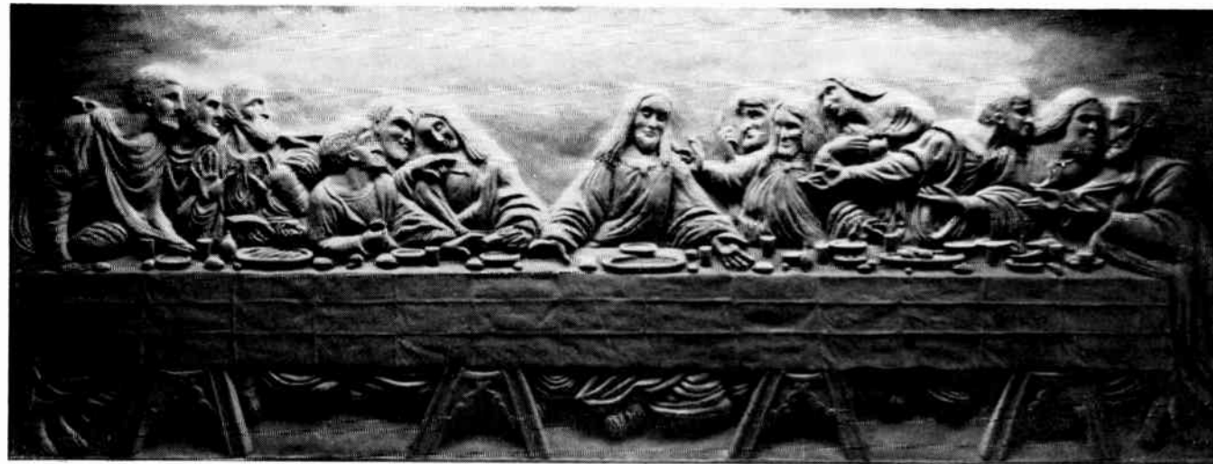
LA DERNIERE CENE