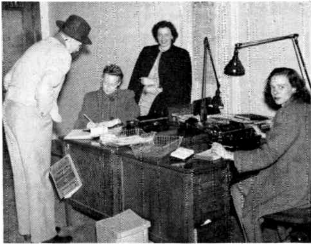
• Office Chills •