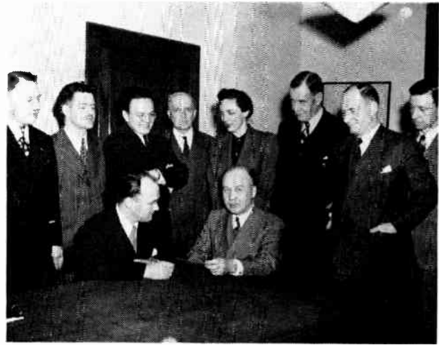
glory of the Gladstone Murray Trophy which was won by the "Greyhounds".