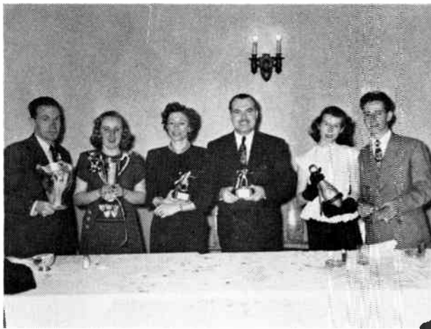
Not To Be Outdone