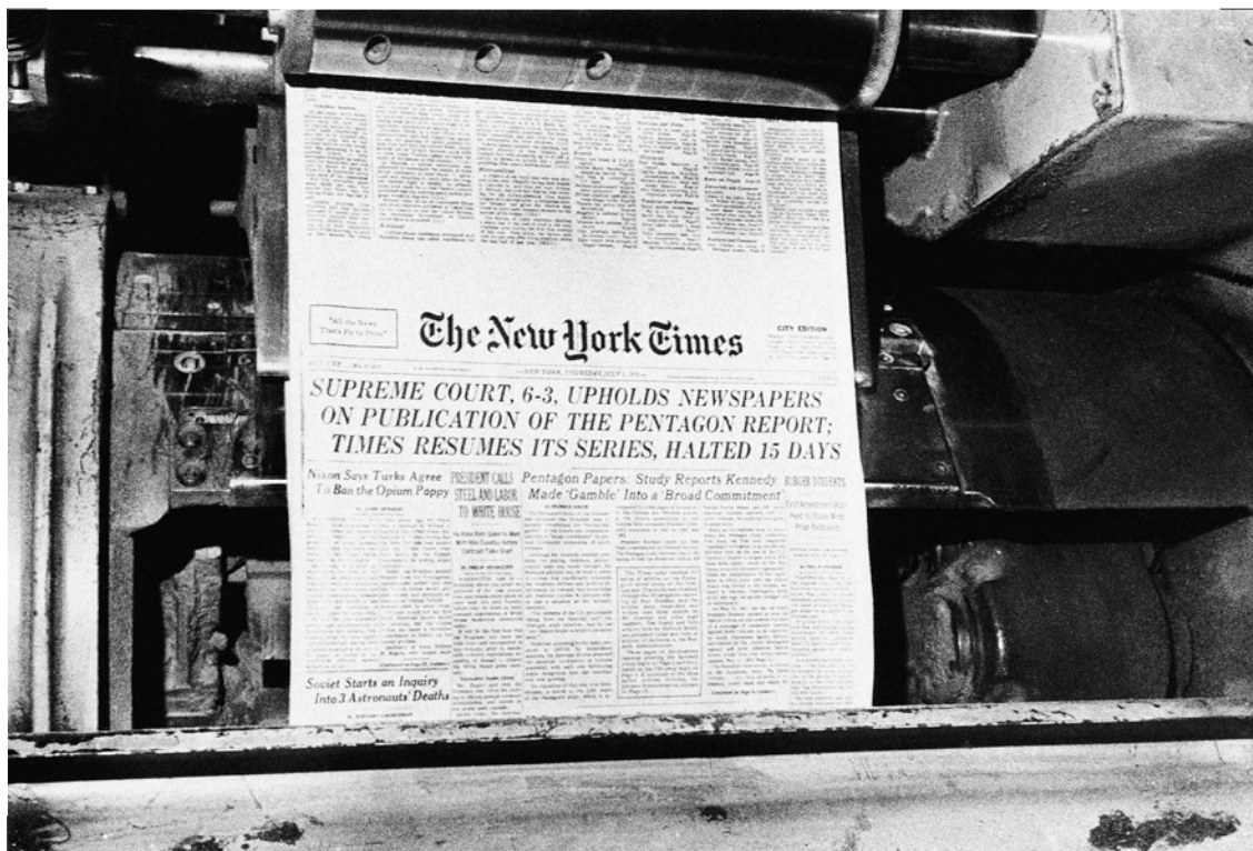
Above: In 1971, the New York Times published the Pentagon Papers despite government claims that doing so would endanger national security. The U.S. Supreme Court ruled that constitutional guarantees of a free press overrode other considerations, and allowed further publication.

Most journalism codes emphasize that telling the truth—being accurate—is essential. “Seek truth and report it” is the first core principle of the Society of Professional Journalists Code of Ethics. The British Editors’ Code of Practice also lists accuracy as its first principle and states, “The press must take care not to publish inaccurate, misleading or distorted information, including pictures.” The one universal ethical principle may