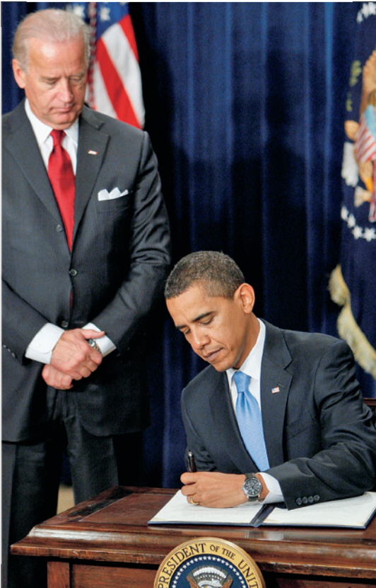
Above: U.S. President Barack Obama signed five executive orders on January 21, 2009, requiring staffers to comply with strict new rules on the Freedom of Information Act. In a memo released that day, President Obama wrote: "The Government should not keep information confidential merely because public officials might be embarrassed by disclosure, because errors and failures might be revealed, or because of speculative or abstract fears."

Although the United States does not have an official secrets act of the type found in many other countries, records properly classified in accordance with a presidential executive order can be withheld. In the post-9/11 environment, the practice of classifying information has increased in much of the world. This imposes new obstacles to citizens seeking both intelligence and law enforcement records. And as governments collect more personally identifiable information, agencies frequently invoke the privacy exemptions as grounds to withhold many government records. These exemptions are sometimes vague and difficult to interpret, and