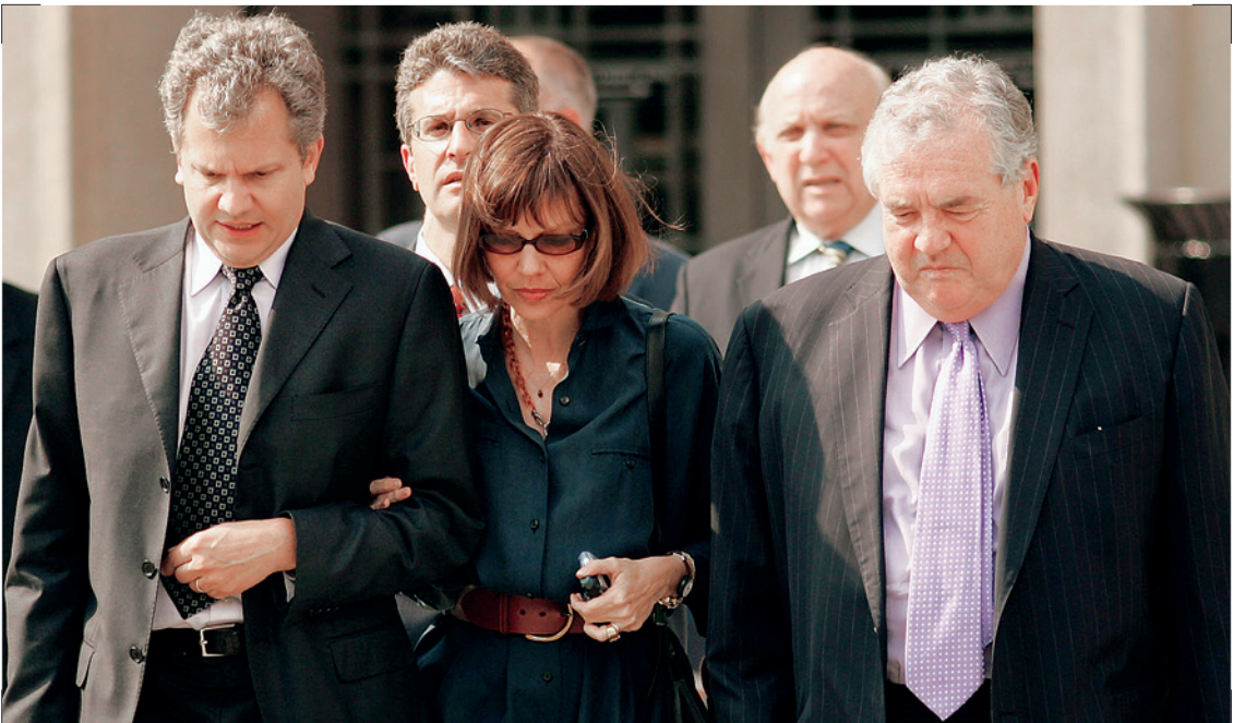
Above: New York Times reporter Judith Miller was jailed for contempt of court for refusing to reveal a confidential source. Miller, accompanied by her legal team, leave the U.S. District Court in Washington, DC, on June 29, 2005.

On the other hand, in March 2008, the United Nations Human Rights Council adopted a resolution condemning “defamation of religions.” And many