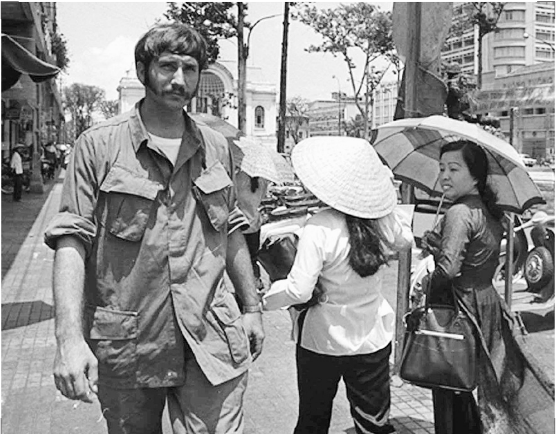
Above: U.S. soldier Ron Ridenhour was largely responsible for uncovering the massacre at My Lai in 1968 by gathering eyewitness accounts and sending letters to 30 members of Congress and to Pentagon officials. Ridenhour later became an investigative journalist.

Most countries at least tacitly acknowledge that court proceedings should be presumed open to the press