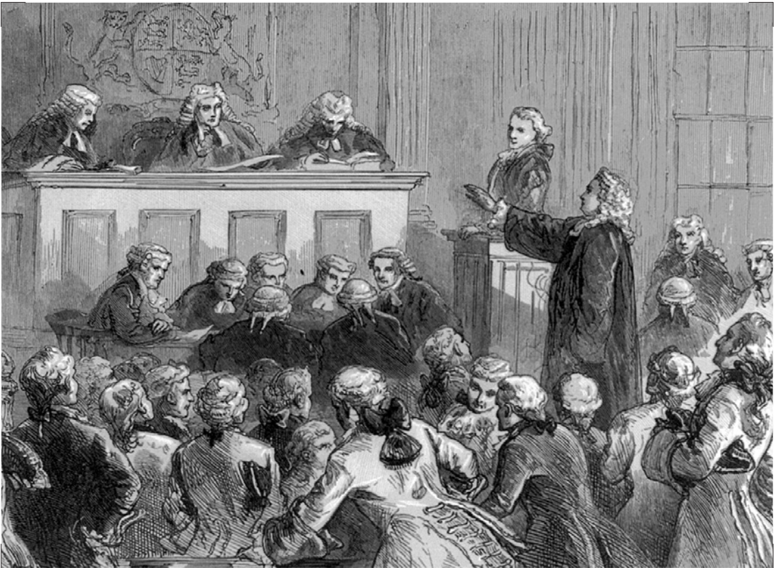
Above: Andrew Hamilton defended John Peter Zenger, publisher of the New York Weekly Journal , who was charged in 1735 with seditious libel for criticizing the Royal Governor. Hamilton argued the truth of Zenger's publication was a defense against seditious libel. The jury acquitted Zenger; an action Hamilton praised: "You have laid a noble foundation for securing to ourselves that to which Nature and the Laws of our country have given us a Right—The Liberty—both of exposing and opposing arbitrary power by speaking and writing Truth."

That absolute language was drafted by revolutionaries shortly after the American War of Independence (1775–1783), during a time of great optimism, but also of great uncertainty. The nation's courts have, over the two hundred-plus years that followed, interpreted the First Amendment as powerful, but perhaps not quite absolute.