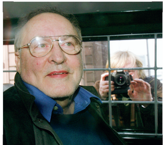
Above: Ernst Zündel, author of The Hitler We Love and Why and publisher of Did Six Million Really Die? , was handed the maximum allowable sentence under German law in 2007 for inciting hatred and denying the Holocaust. Holocaust denial is a specific criminal offense in several European countries.

Punishment may also await those who challenge the accepted wisdom