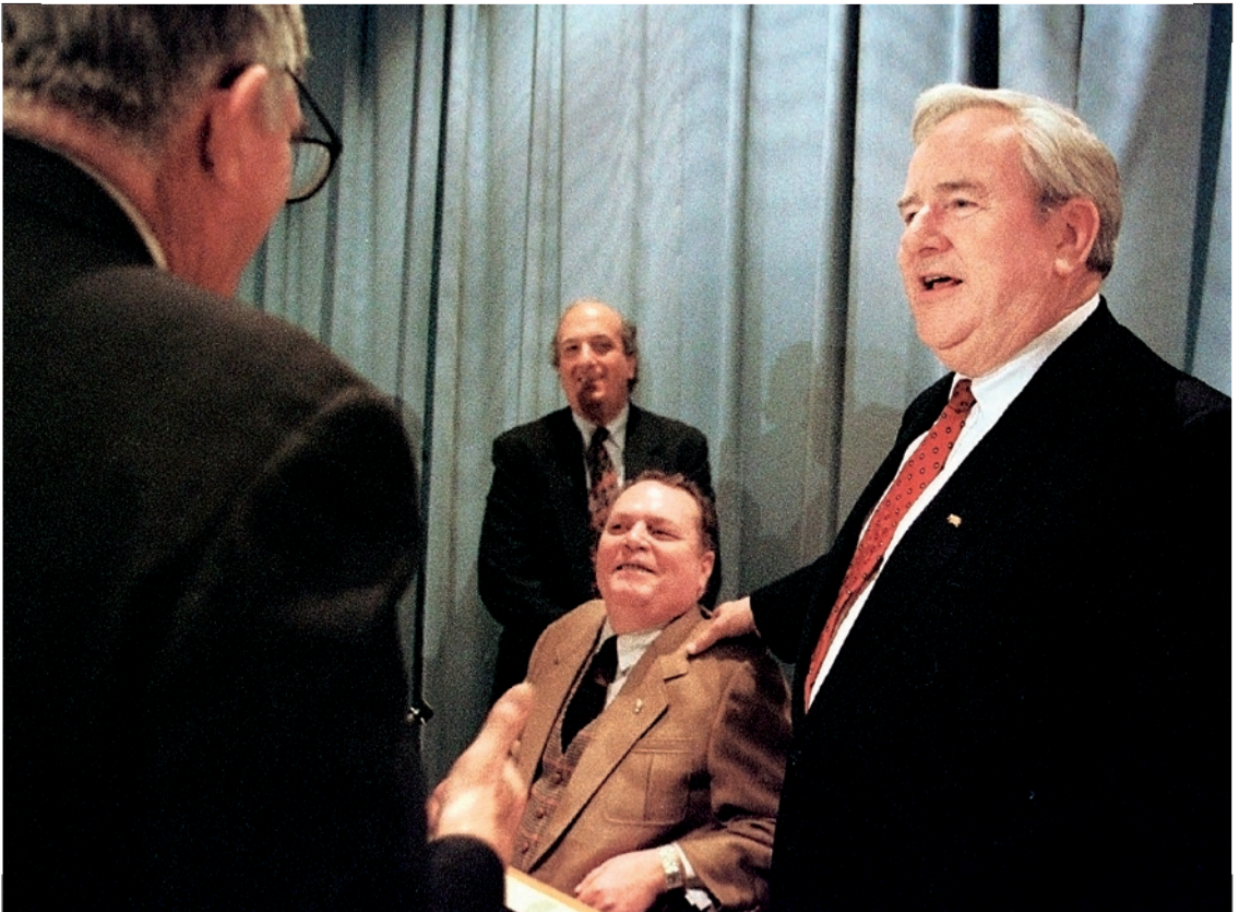
Above: After Hustler owner Larry Flynt, left, published a lewd parody of Virginia televangelist Rev. Jerry Falwell, right, Falwell sued Flynt for libel. The case reached the U.S. Supreme Court where Chief Justice William Rehnquist wrote that Falwell, as a public figure, must tolerate such attacks in order to give sufficient "breathing space" to the freedoms protected by the First Amendment.

Courts in the United States, however, were slow to recognize a right to privacy. Although the Supreme Court has interpreted the Fourth Amendment of the U.S. Constitution to protect individuals from unreasonable searches and seizures, as well as other unwarranted