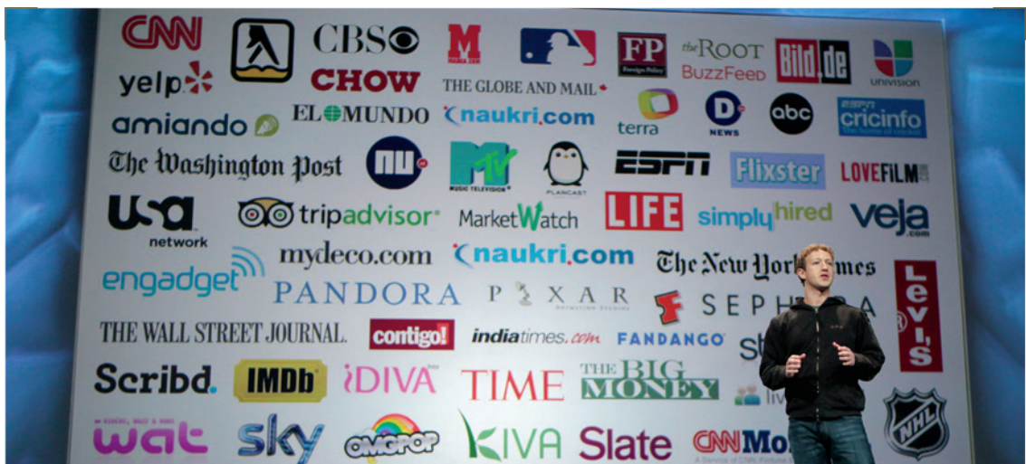
Above: Social media raises new questions for journalists. Facebook CEO Mark Zuckerberg delivered the keynote address at an internet conference in San Francisco on April 21, 2010.

But social media pose new challenges for the ethical journalist. Verifying postings can be difficult. Reporters should make clear when they utilize social media sites as the basis for a story. They should exercise special caution when using information concerning minors, which could damage someone's reputation, or when using information that someone else claims to own—such as a trade secret. The laws of libel, privacy, and copyright still apply in cyberspace.