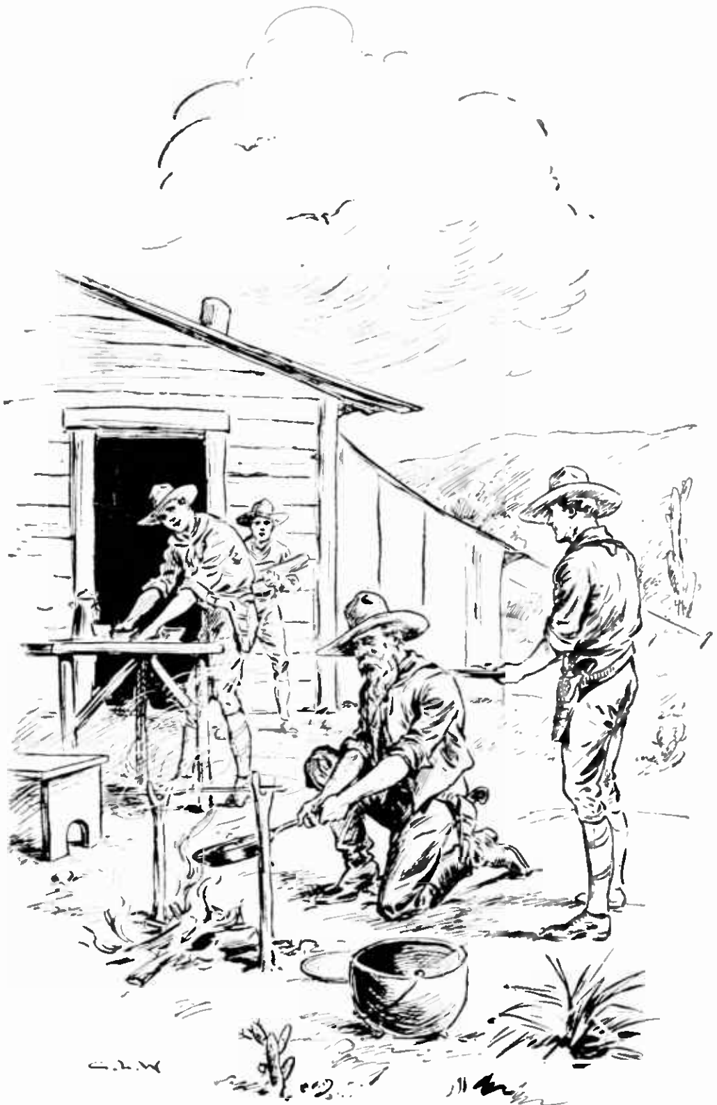
Soon the savory odors of the frying with crisp slices of bacon....filled the air.—Page 208.