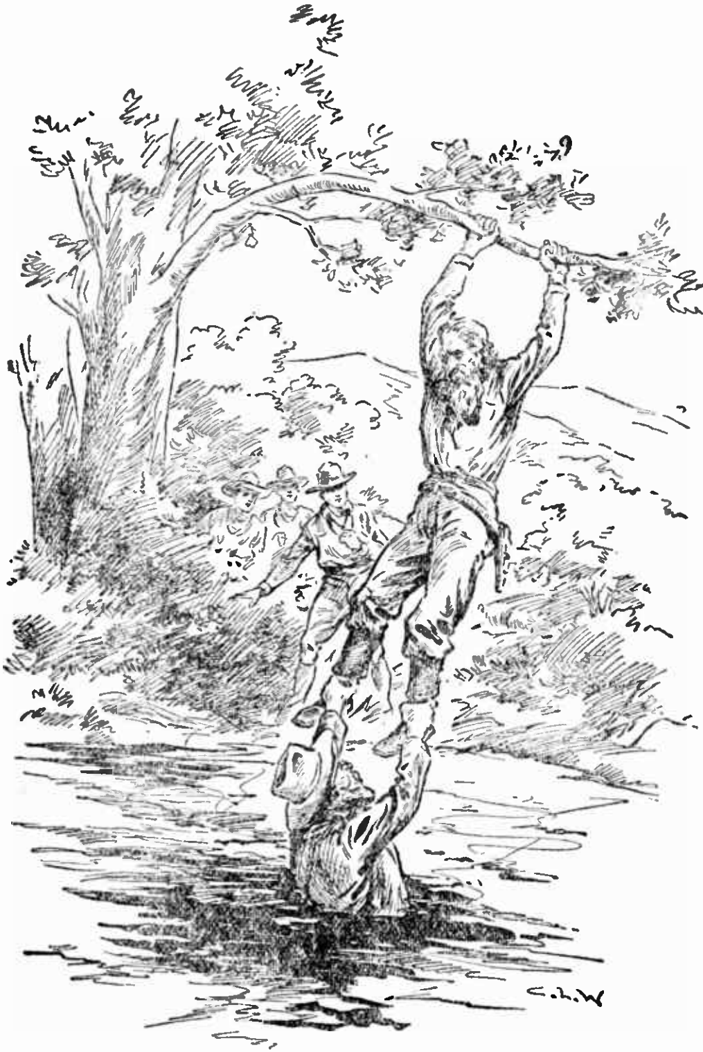
The professor seized Zeb's boots with the grasp of a drowning man.—Page 240.