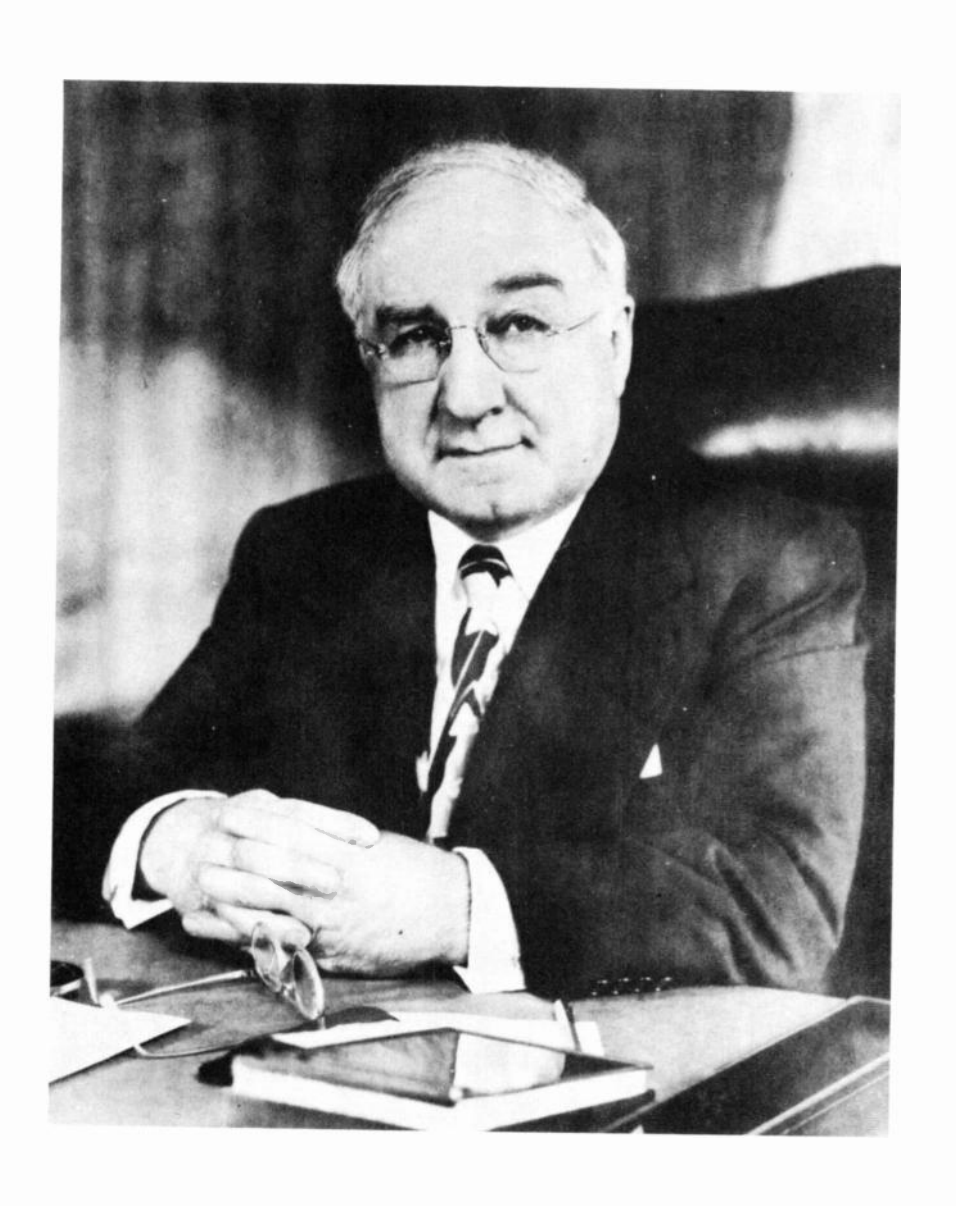
JAMES CAESAR PETRILLO