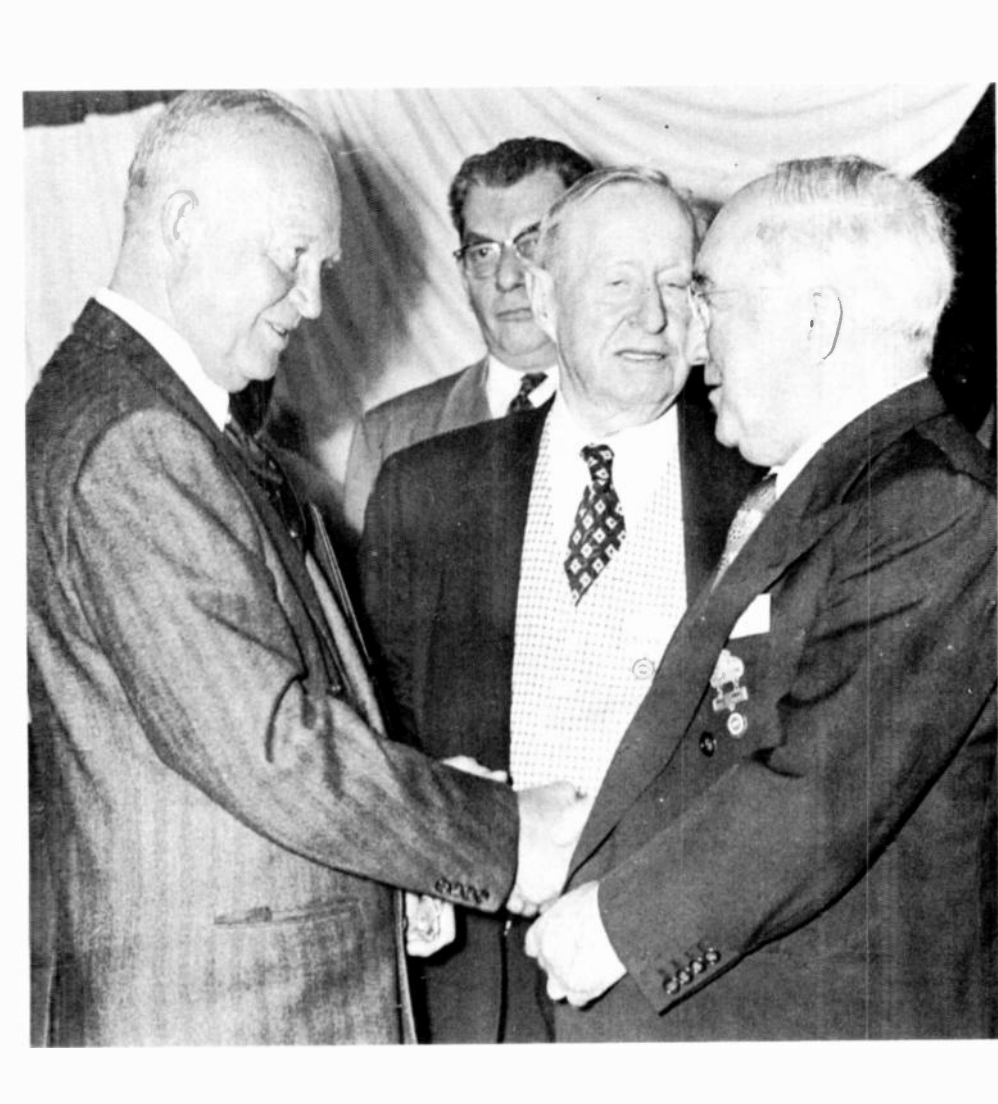
PETRILLO GREETS PRESIDENT EISENHOWER AT AN AFL CONVENTION