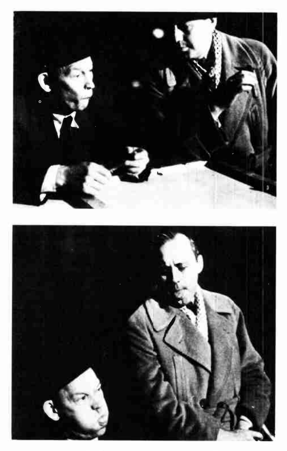
Two of radio's top clowns during a rehearsal break-Fred Allen and Jack Benny.