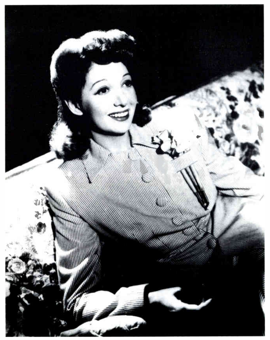
My very glamorous mother, 1939.