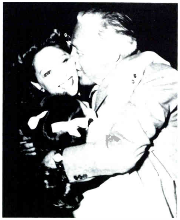
His hair bleached almost blond, Daddy returns home.