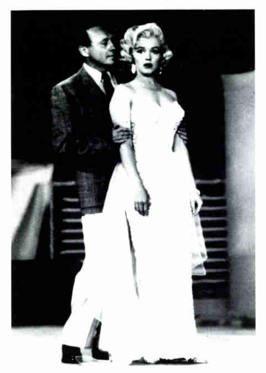
No need to identify this gorgeous lady!