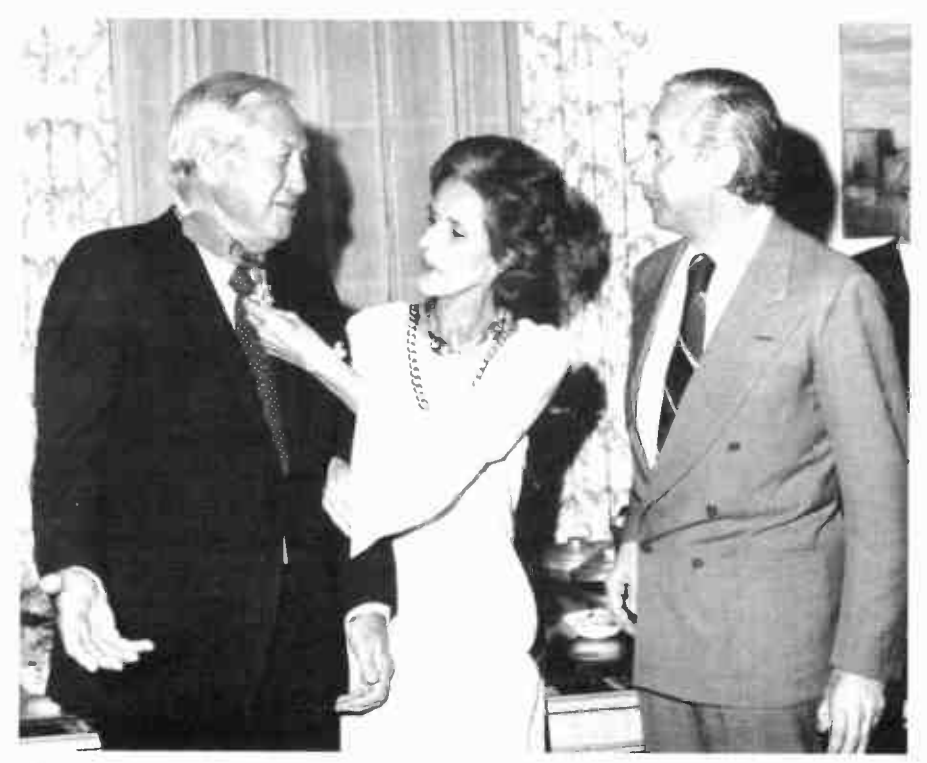
The Order of Merit of the Republic of Italy is conferred upon Paley by Italian consul general Vieri Traxler.