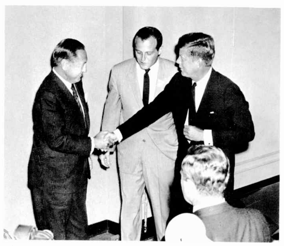
Paley greets John F. Kennedy just before the first historic Kennedy-Nixon debate in Chicago on September 26, 1960.