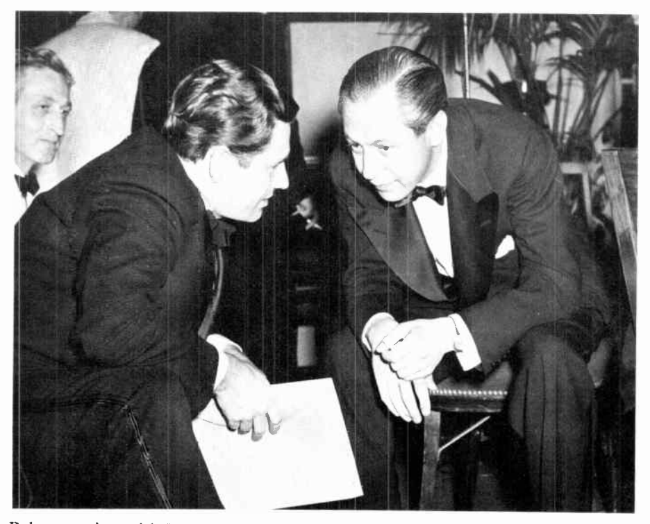
Paley meeting with Nelson Rockefeller in 1941.