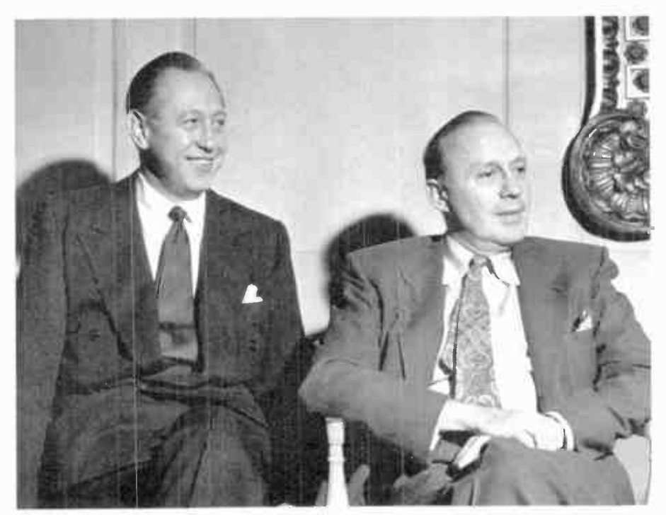
Paley and Jack Benny in 1950.