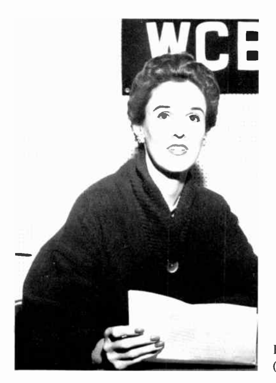
Babe Paley at the WCBS studio.