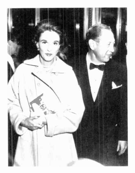
Babe and Paley attending a premiere in 1954.