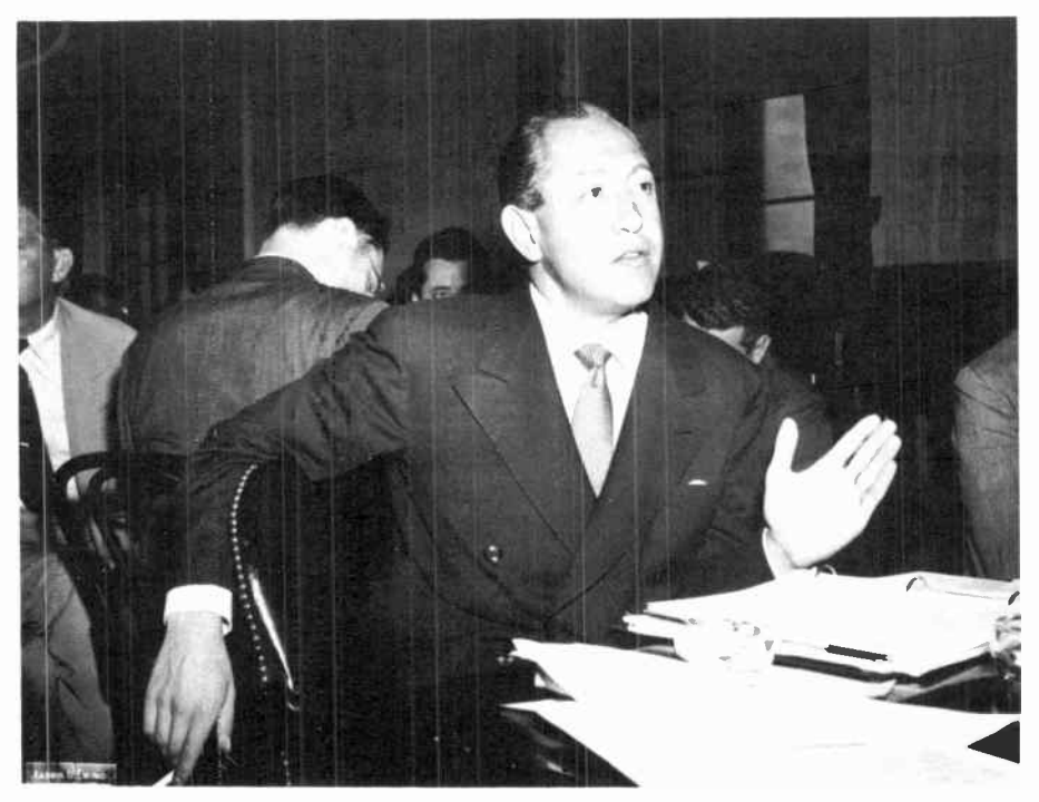
Paley appearing before the Senate Interstate Commerce Committee in 1941.