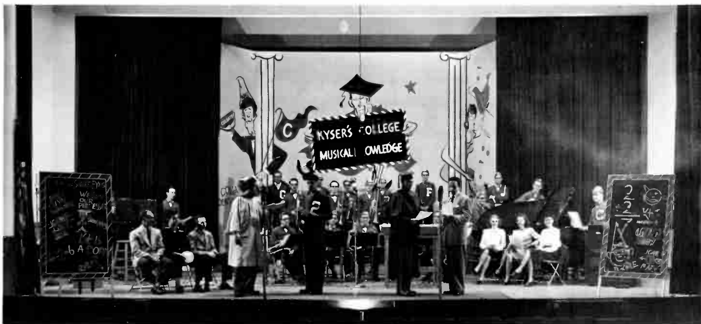
Kay Kyser's show (NBC) in session, with Professor Kyser addressing the comedian Ish Kabibble.