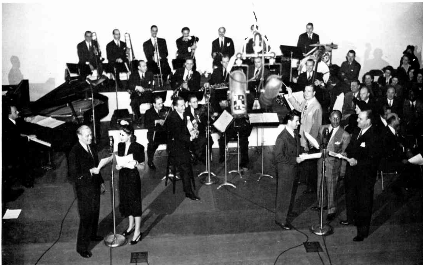
Overall view of The Jack Benny Program (NBC) in the early Forties, with Phil Harris leading his orchestra and, in the foreground, left to right, Benny, Mary Livingstone, Dennis Day, Eddie Anderson and Don Wilson.