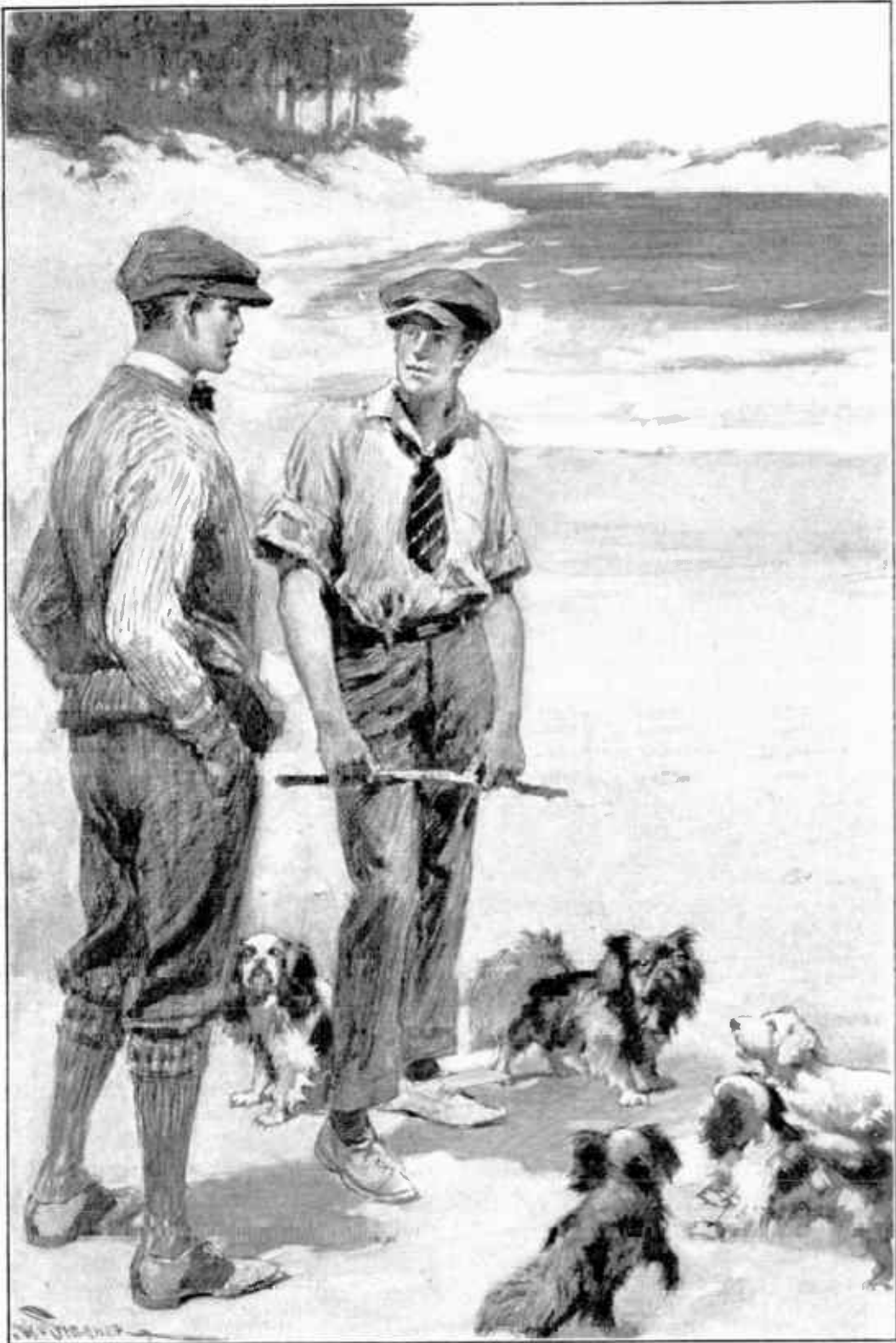
The two boys would discuss boats, fishing, and kindred interests. Page 76.