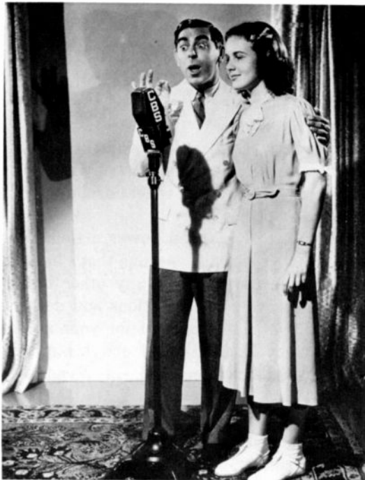
The Eddie Cantor Show. Eddie Cantor and Deanna Durbin.