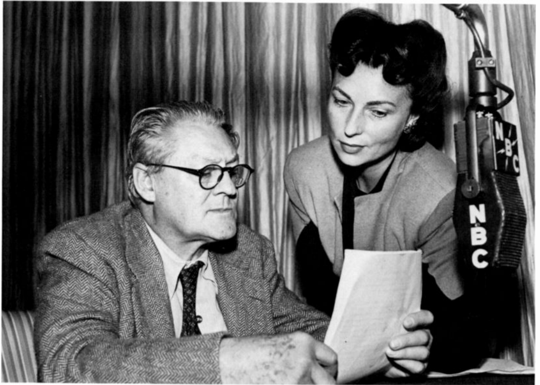
Mayor of the Town. Lionel Barrymore and Agnes Moorehead.