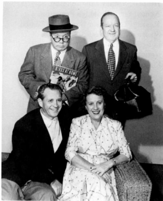
Fibber McGee and Molly. Front: Jim and Marian Jordan. Back: Bill Thompson (Wallace Wimple) and Arthur Q. Bryan (Doc Gamble).