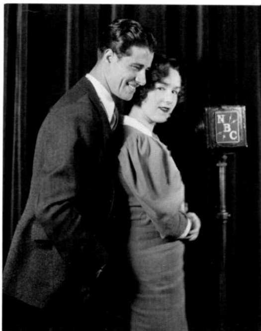
Betty and Bob. Don Ameche and Betty Churchill.