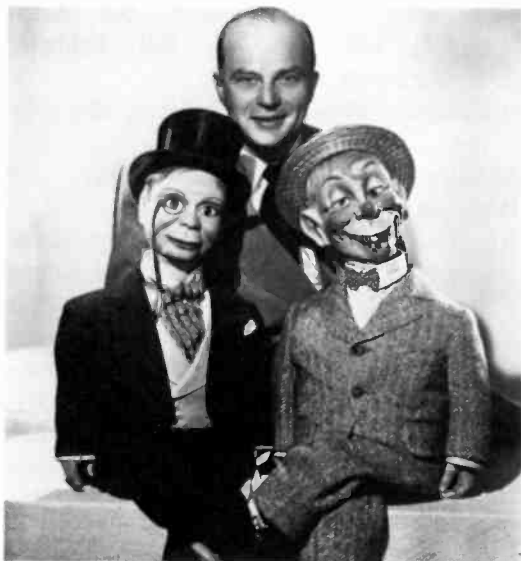
The Edgar Bergen and Charlie McCarthy Show. Edgar Bergen (center) with dummies Charlie McCarthy (left) and Mortimer Snerd.