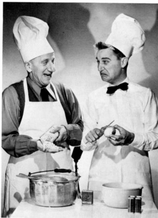
The Jimmy Durante-Garry Moore Show. Jimmy Durante (left) and Garry Moore.

Type: Comedy-Variety Host: Jimmy Durante. Regulars: Arthur Treacher, Barbara Jo Allen, Candy Candido, Florence Halop.