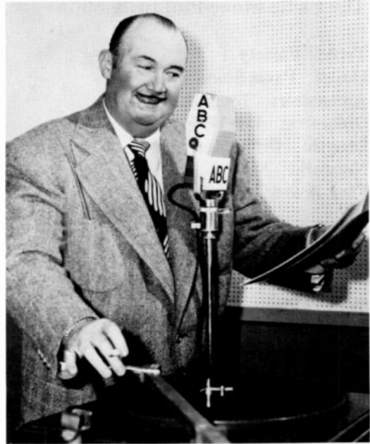
The Paul Whiteman Hour. Paul Whiteman.

Type: Variety Format: Performances by undiscovered professional talent.