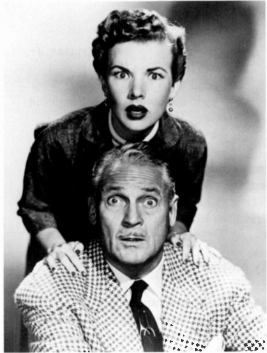
My Little Margie. Charles Farrell and Gale Storm.