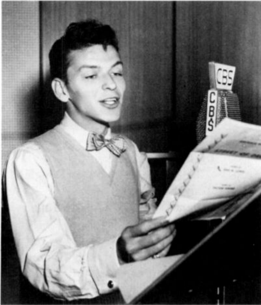
Songs By Sinatra. Frank Sinatra.

Format: Presented the material of amateur songwriters whose work was performed by professionals, then judged, evaluated, and offered for sale. Became the basis for a television series of the same title.