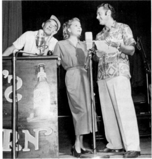
Duffy's Tavern. Left to right: Ed Gardner and guests Frances Langford and Jon Hall.

Format: The misadventures and dealings of Archie, a con artist who operated and managed Duffy's Tavern, a run-down restaurant bar on Third Avenue in New York City, for the never-seen Mr. Duffy.