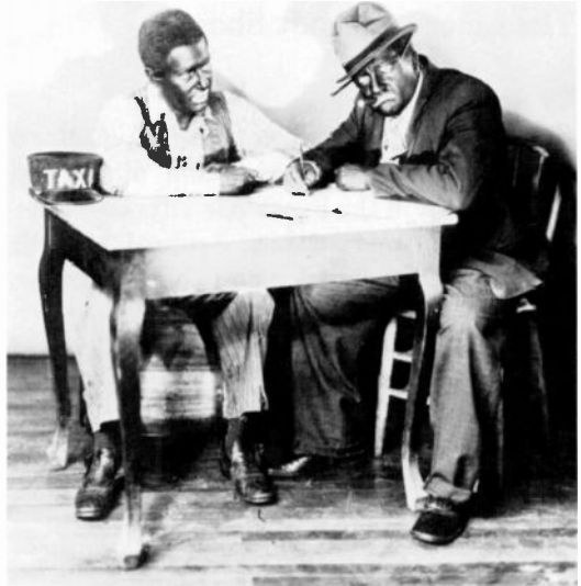
The Amos and Andy Show. Freeman Gosden (left) and Charles Correll in makeup for Amos and Andy respectively.