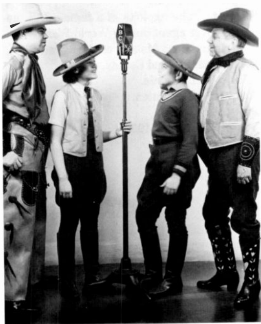
The Tom Mix Straightshooters. An early cast of the series.