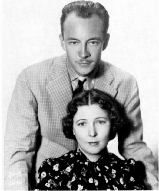
First Nighter. Co-stars Barbara Luddy and Les Tremayne. The photo, dated July 14, 1937, is the first picture ever taken of Luddy and Tremayne together.