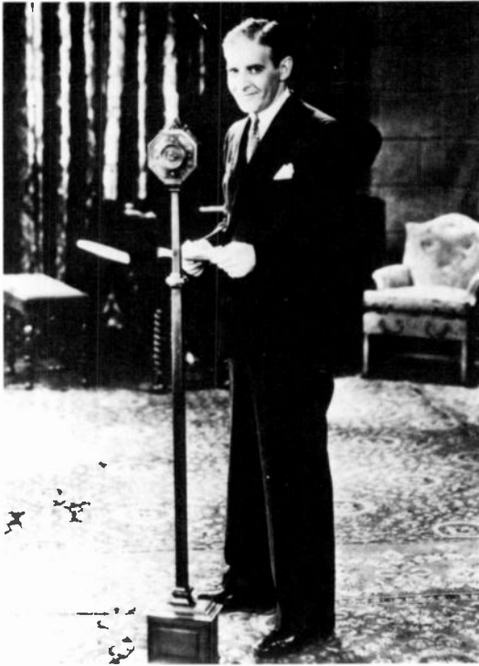
The Walter Winchell Show. Walter Winchell.