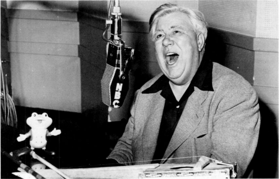
The Smilin' Ed McConnell Show. Ed McConnell. Froggie the Gremlin is to his left.

Length: 30 minutes. Network: Mutual. First Broadcast: 1930.