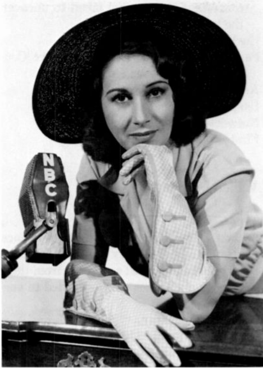
What's My Name? Arlene Francis.