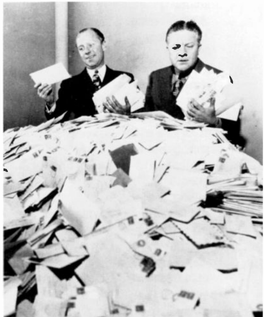
The Amos and Andy Show. Pictured are Freeman Gosden (left) and Charles Correll, out of makeup and in the midst of listener mail offering suggestions for naming the baby "born" to Amos and Ruby. The photograph is dated December 8, 1936.