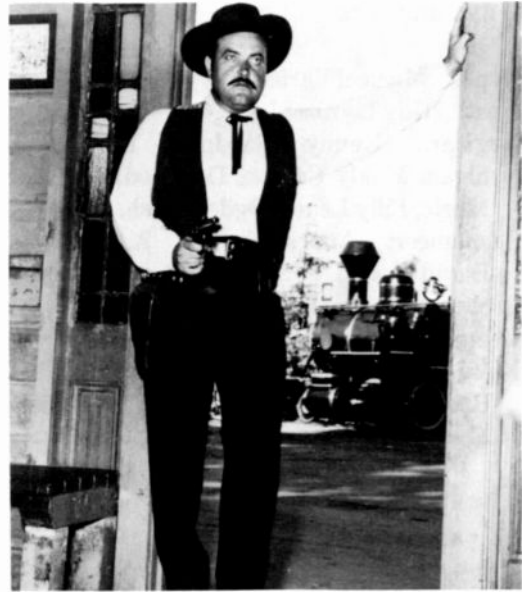
Gunsmoke. William Conrad in costume as Marshal Matt Dillon.

Format: The dramatic story of Matt Dillon, a U.S. Marshal, as he attempted to maintain law and order in Dodge City, Kansas during the late 1800s. Became the