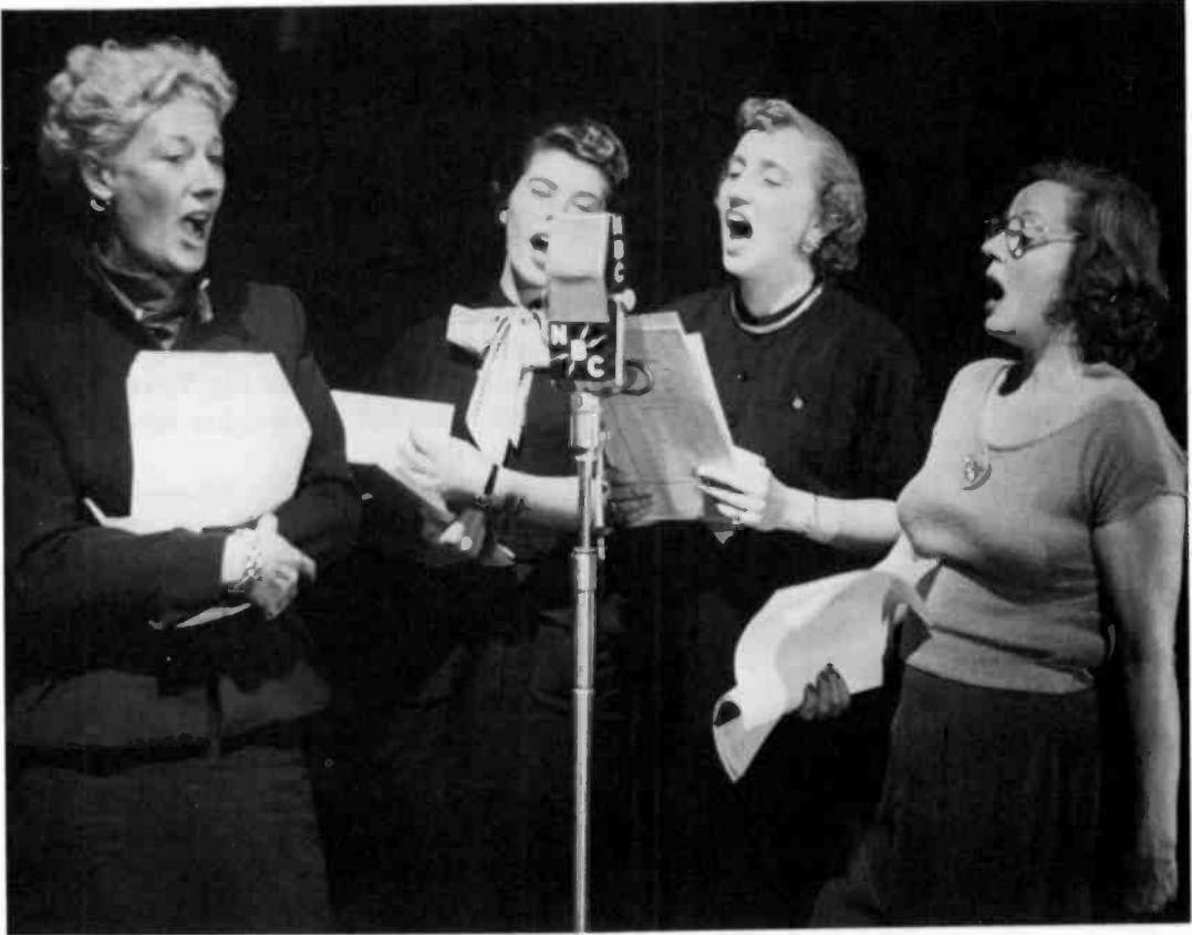
The Big Show. Left to right: Guests Joan Davis, Mindy Carson, and Margaret Truman, with hostess Tallulah Bankhead.