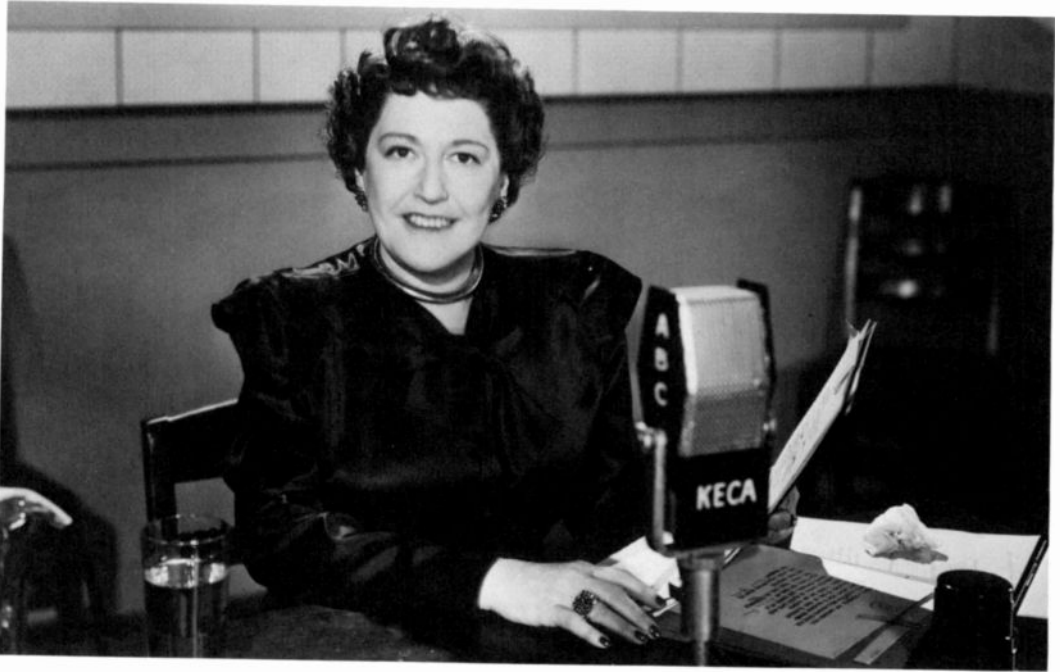
The Louella Parsons Show. Louella Parsons.

Orchestra: Leopold Spitalny. Length: 15 minutes. Network: Blue. First Broadcast: 1938.