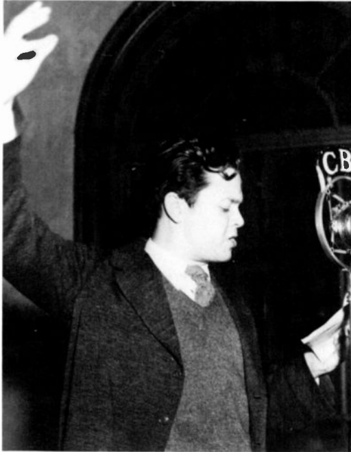
Orson Welles' Almanac. Orson Welles.

Format: Events in the life of an orphaned girl named Sunday—a small-town Virginia girl who married a wealthy English Lord in an attempt to find happiness.