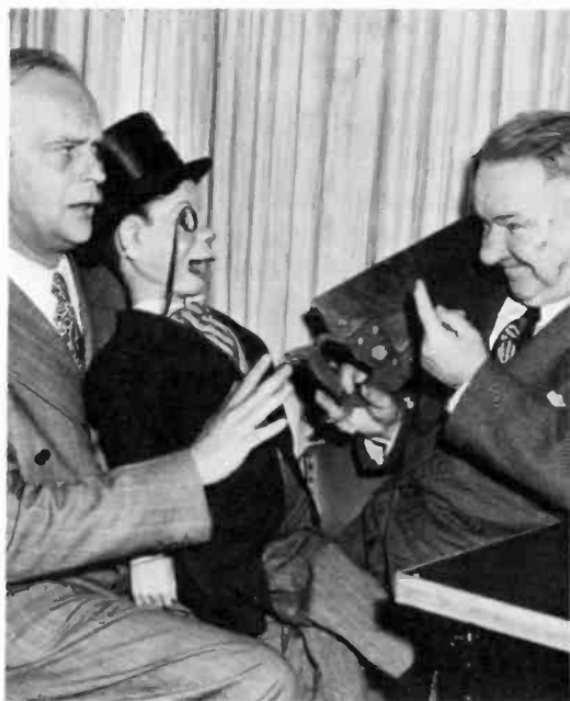
The Edgar Bergen and Charlie McCarthy Show. Left to right: Edgar Bergen, Charlie McCarthy, and W.C. Fields. (The photo depicts the feud that existed between Fields and McCarthy.)