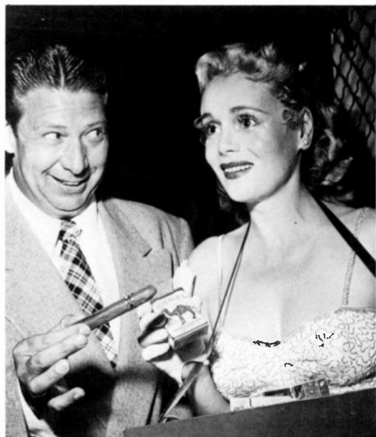
The George Burns and Gracie Allen Show. Harry Von Zell, George's long-time announcer, with Marie Wilson ("My Friend Irma").