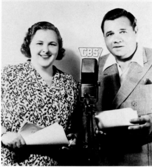
The Kate Smith Show. Kate Smith with guest Babe Ruth.