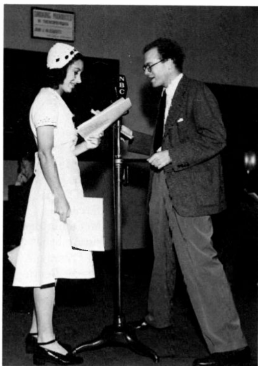
Betty and Bob. Arlene Francis and Van Heflin.