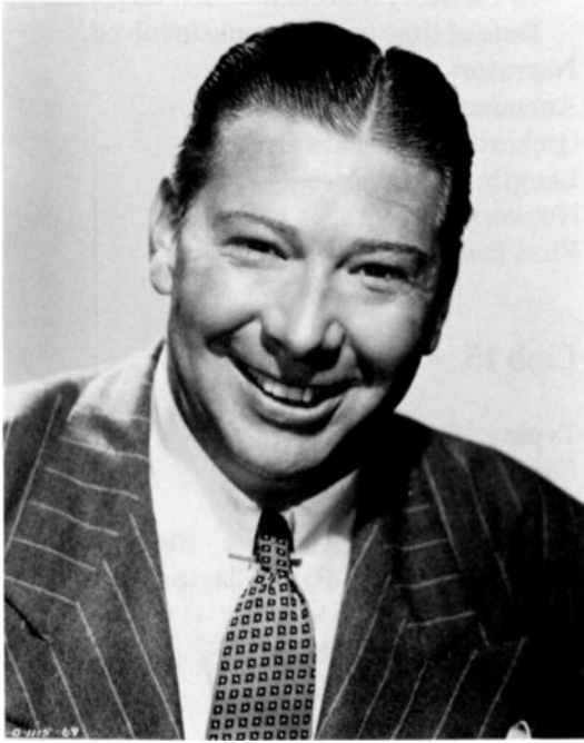
Chicken Every Sunday. Harry Von Zell.