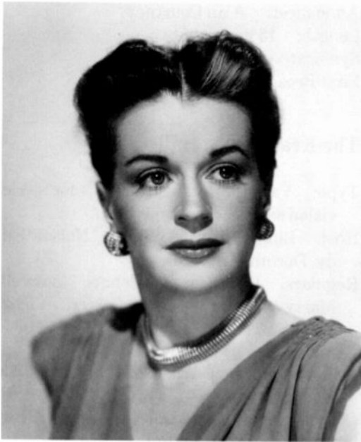
The Lady Esther Screen Guild Playhouse. Pictured is Rosemary DeCamp, one of many performers to guest on this long-running program.