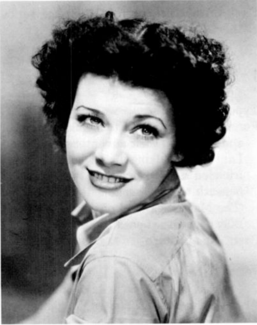
The Kraft Music Hall. Penny Singleton in a 1937 pose when she made her radio debut on "The Kraft Music Hall." At the time she used her real name, Dorothy McNulty; she became the blonde Penny Singleton in 1938 (see "Blondie" for photo).

Length: 15 minutes. Network: CBS. First Broadcast: 1942.