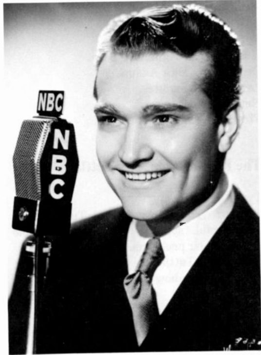
The Red Skelton Show. Red Skelton.

Format: The adventures of a brash, wise-cracking young girl from a small town in Nebraska as she struggled to achieve fame and fortune as a model in New York City.