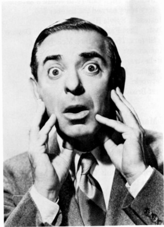
Time to Smile. Eddie Cantor.

Type: Quiz Format: Selected studio audience members competed in a series of question and answer sessions designed to be played in ten second intervals. Each correct answer to a question earned a player a merchandise prize, the value of which began at $1,000 and decreased by $100 with each second the player used to answer. Host: Bud Collyer. Length: 30 minutes.