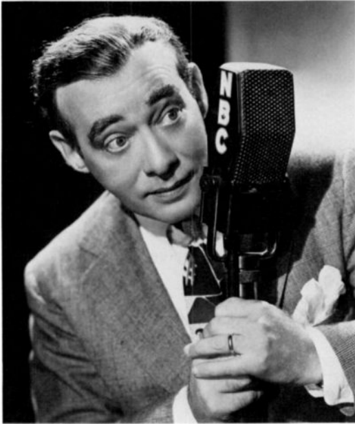
The Phil Baker Show. Phil Baker.

hectic lives of Phil Harris and his wife Alice Faye.