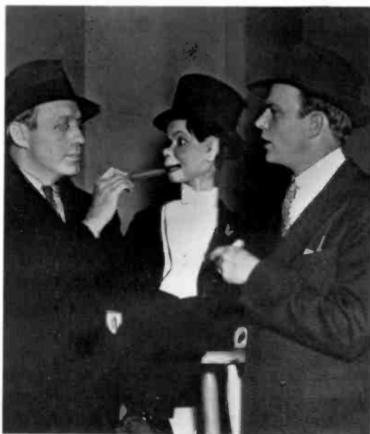
The Edgar Bergen and Charlie McCarthy Show. Left to right: Guest Jack Benny, Charlie McCarthy, and Edgar Bergen.