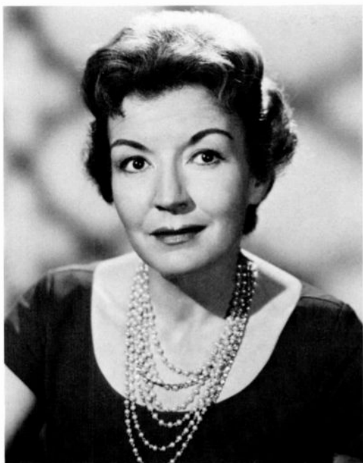
On Stage. Cathy Lewis.

Orchestra: Paul Whiteman. Length: 30 minutes. Network: ABC. First Broadcast: 1945.