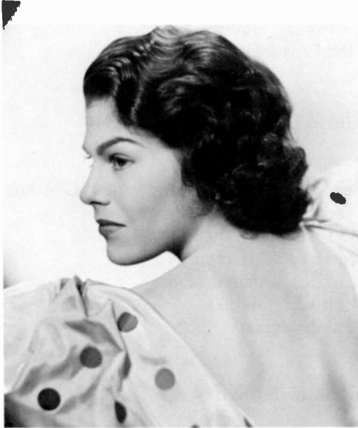
Midstream. Betty Lou Gerson.