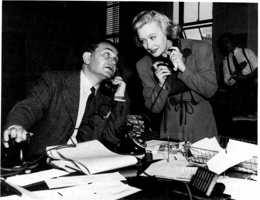
Big Town. Edward G. Robinson and Ona Munson.

Cast: Steve Wilson Edward G. Robinson Edward Pawley Walter Greaza Lorelei Kilbourne the society editor Claire Trevor Ona Munson