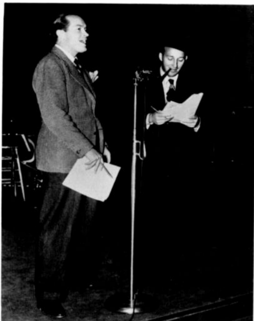
The Bing Crosby Show. Guest Bob Hope and Bing Crosby.