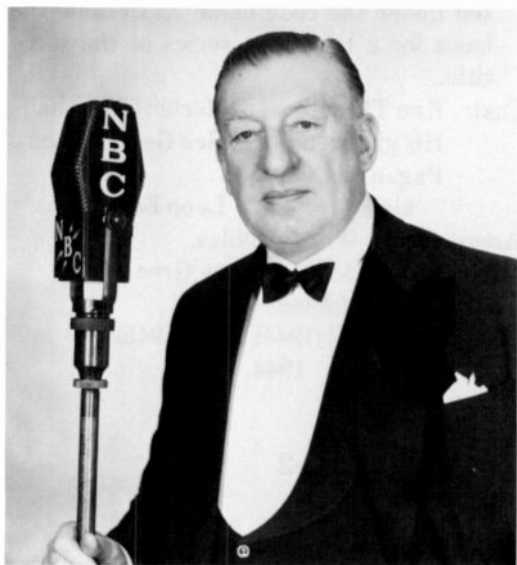
Major Bowes and His Original Amateur Hour. Major Bowes.