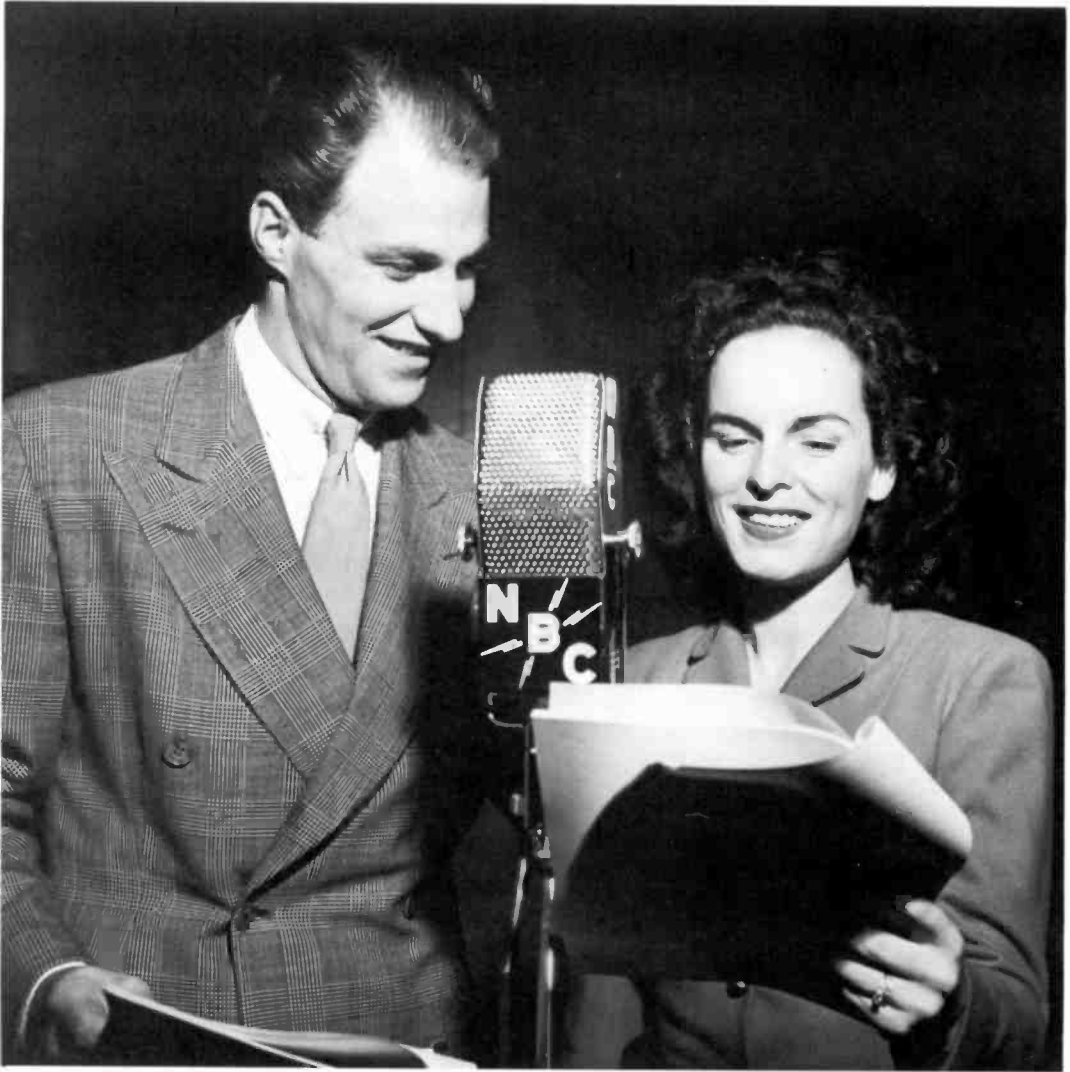
Abie's Irish Rose. Richard Coogan and Mercedes McCambridge.