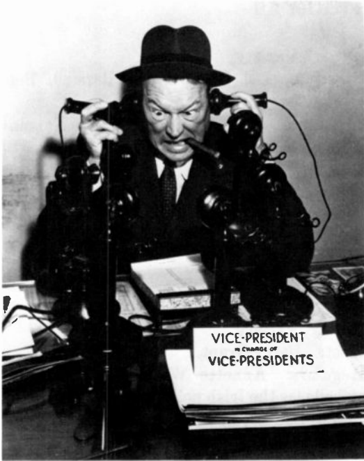
The Fred Allen Show. Fred Allen.