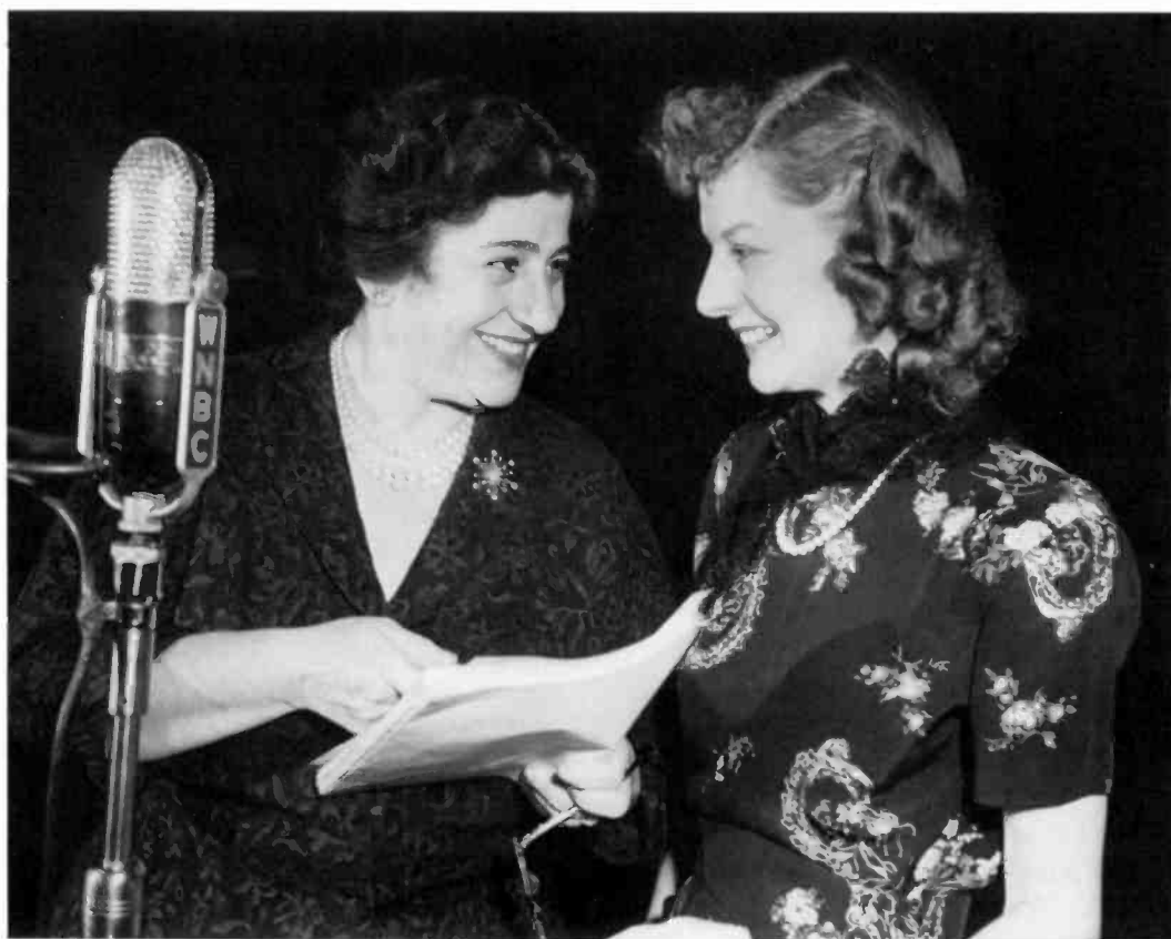
House of Glass. Gertrude Berg (left) and Ann Thomas.