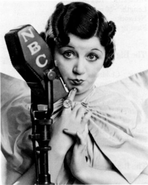
Betty Boop Fables. Mae Questel.