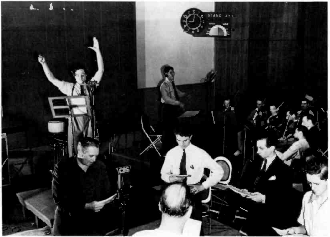
The Mercury Theatre on the Air. Here, Orson Welles (upper left with arms raised) directs the single most famous radio broadcast—"The War of the Worlds" (October 30, 1938), a drama about Mars invading Earth that seemed so real it caused a nationwide panic.