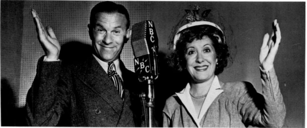
The George Burns and Gracie Allen Show. George Burns and Gracie Allen in a late 40s pose.

Format: The story of a not-too-bright husband, his patient wife, his chiseling best friend, and his overbearing boss.