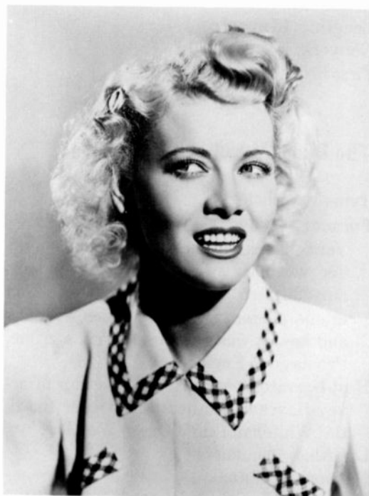
Blondie. Penny Singleton.

Cast: Blondie Bumstead Penny Singleton Alice White Patricia Van Cleve Ann Rutherford