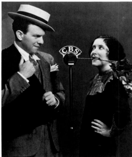
The George Burns and Gracie Allen Show. An early 1930s photo of George Burns and Gracie Allen.

First Broadcast: 1931. Also titled "Maxwell House Coffee Time."