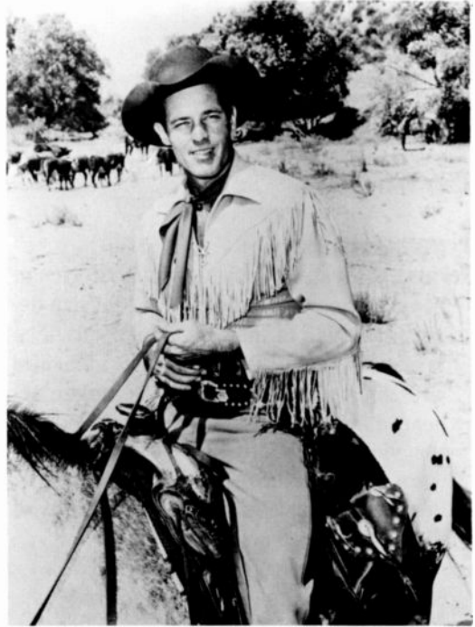
Wild Bill Hickok. Guy Madison.