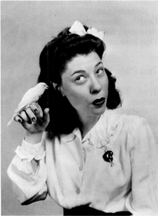
The Judy Canova Show. Judy Canova.

Length: 30 minutes. Network: NBC. First Broadcast: 1945.