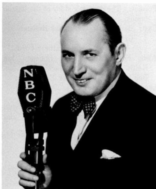
Believe It Or Not. Robert Ripley.