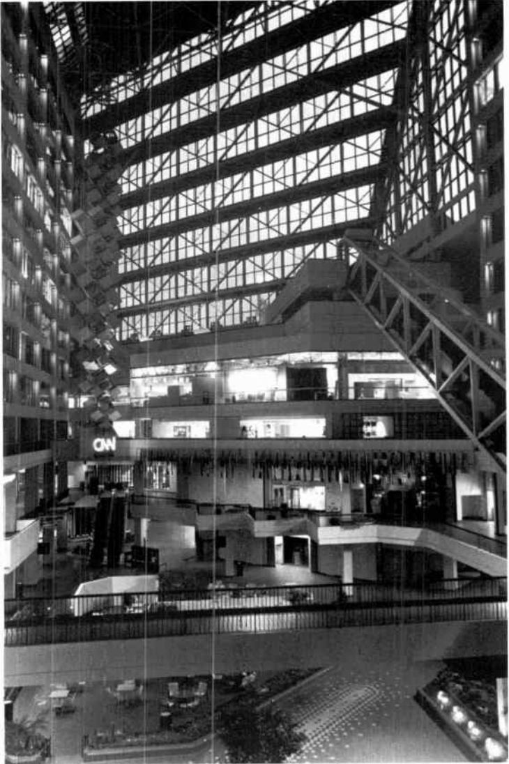
The new home of CNN