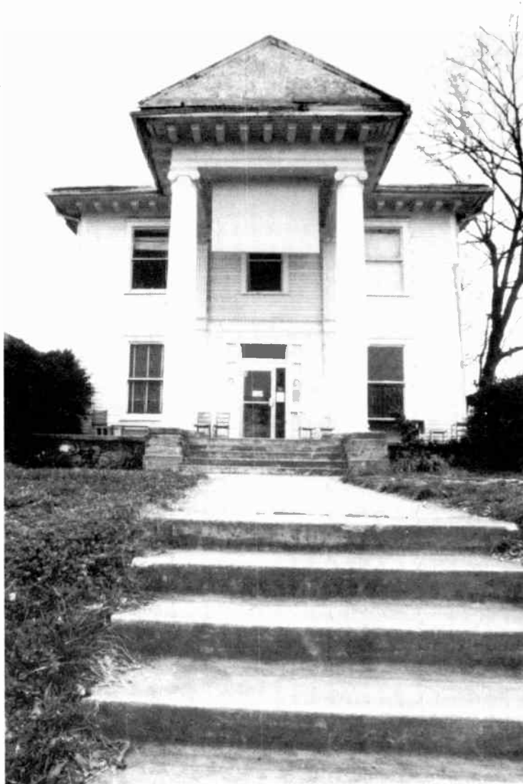
The old white house, first home of CNN