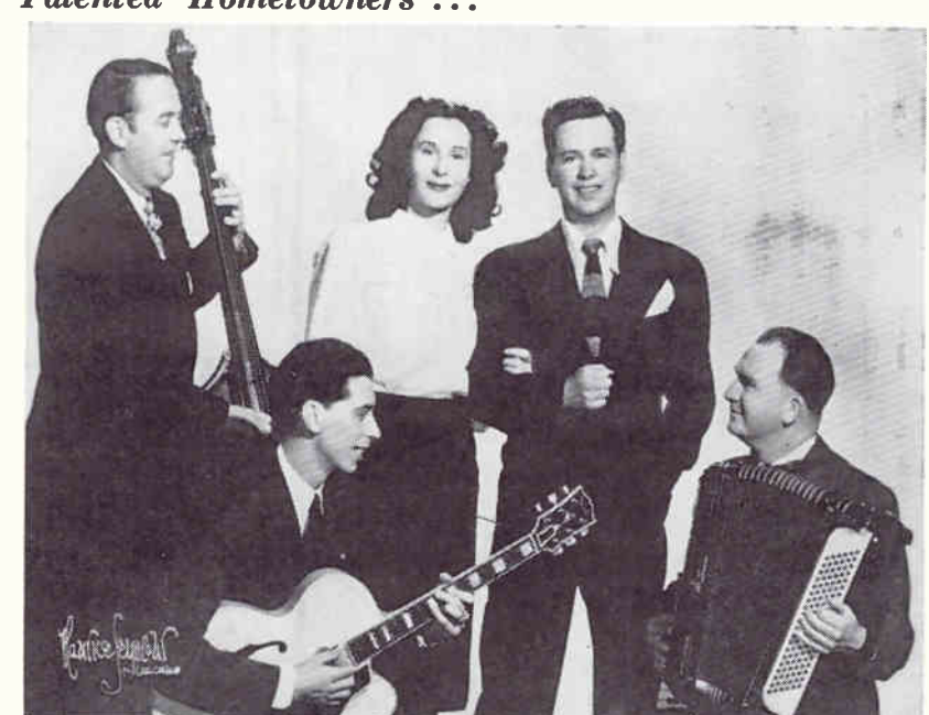
WILLIAMSON-DICKIE "HOMETOWNERS" brighten up listening every Tuesday, Thursday, Saturday mornings at 6:15 a.m. over Radio WOW.