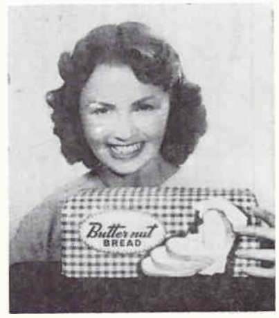
The Smiling Lassie displays the new Butter-nut wrapper.