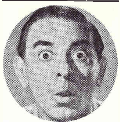
Eddie Cantor Show 8:30 Sunday