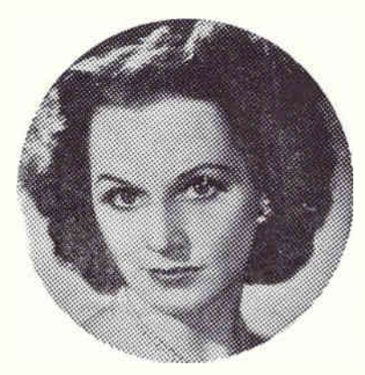
Nadine Connor ... a frequent guest on "The Railroad Hour" Mondays at 7:00