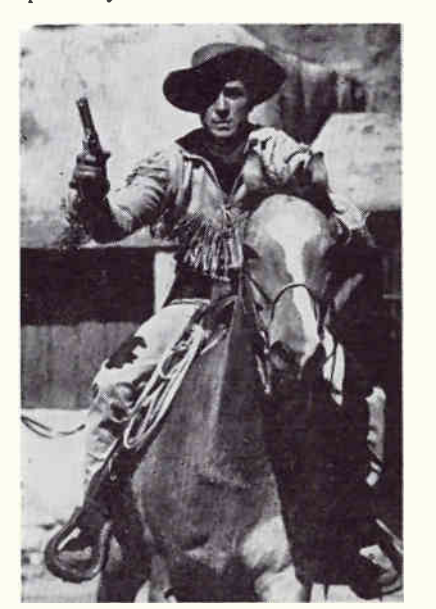
"The Range Rider" (Peter Pan Bread) rides, shoots, fights like a demon, uses no "stand-ins." at 5:30 p.m., Sundays after "Wild Bill Hickox.

Don't be too surprised if another very good 5-day-a-week serial-type show goes in the 10:45 a.m. to 11 spot very soon.