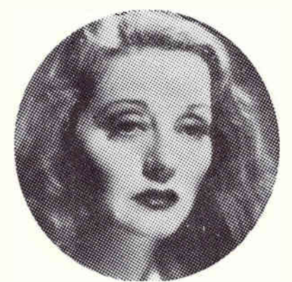
Tallulah Bankhead ... she femcees "The Big Show" 5:30 on Sundays