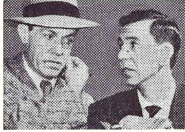
"Dragnet" Detectives Friday and Romero remain in their regular time at 8 p.m., Thursdays for Fatima Cigarettes.