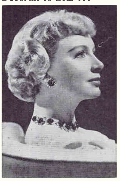
Deborah Kerr will star in "Tums Tollywood Theatre" on October 2.