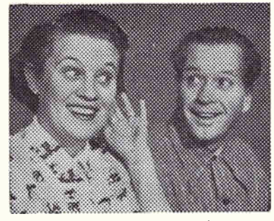
Yes, it's good news that "Fibber Mc-Gee and Molly" are back for Pet Milk at 8:30 p.m., Tuesdays on WOW.