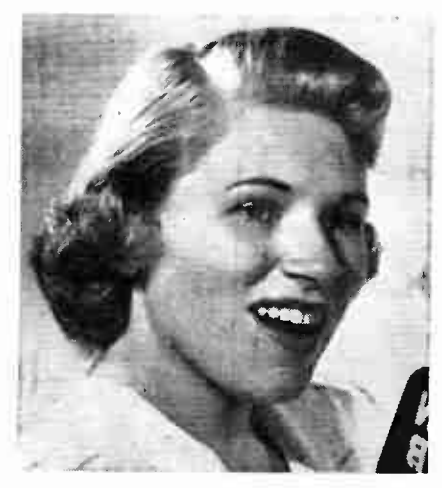
EILEEN WILSON is feme singing star of "Your Hit Parade."