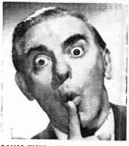
BANJO-EYED CANTOR will emcee "Take It or Leave It" on NBC-WOW, starting September 11.