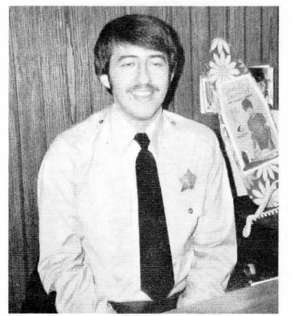
Dale Janus Security