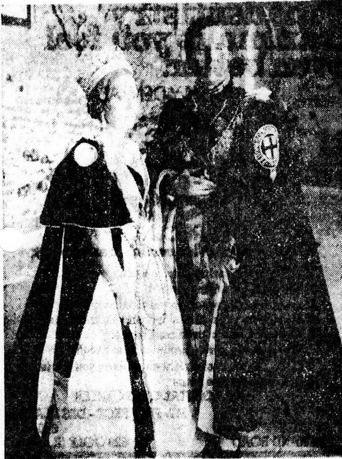
ANNETTE CROSSBIE is Queen Victoria and Robert Hardy plays her husband, Prince Albert, in "Edward the King," new Mobil Showcase series starting at 7 tonight on WGN-TV, Channel 9.

'Edward the King' is a hit without network support